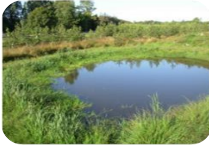
1. Establishing and maintaining wetlands