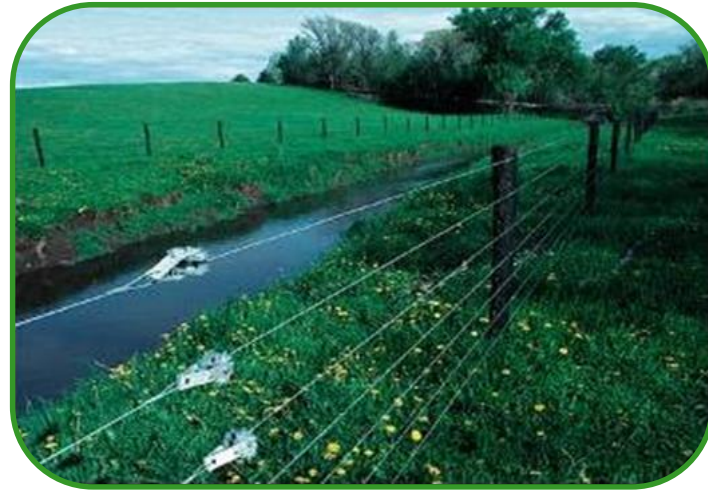
Fencing off watercourses