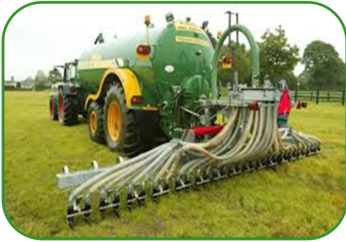
Use of band or injection spreading machinery