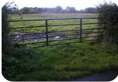
1. Re-siting gateways away from high-risk areas