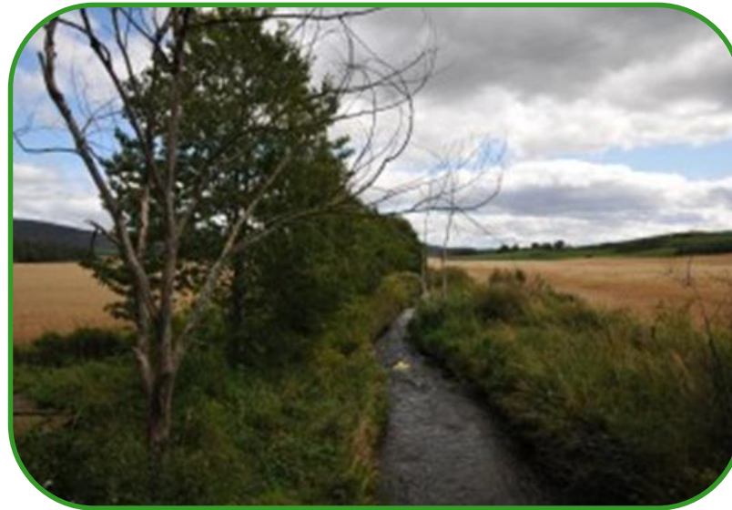
Riparian Buffer Strip