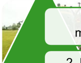
2. Use of slurry band or injection spreading machinery