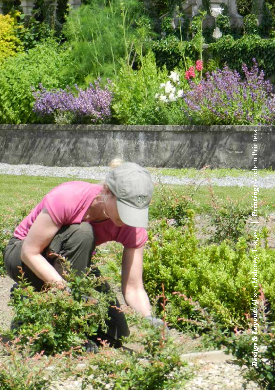
Design & Layout: Alison Maloney, Teagasc | Printing: Modern Printers