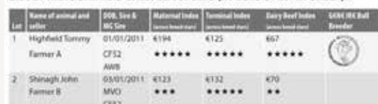
List of male animals entered for sale (in date of birth order).

The examples below highlight the potential movement in Maternal and Terminal Index value of bulls based on their reliability.