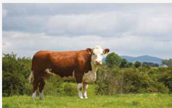
Ranking of Holstein-Friesian (HF=100) and beef x HF steers for production traits

Although there is an average breed ranking for different traits, there is huge variation within breed and consequently, large overlap between breeds, especially for individual bulls, in these traits.