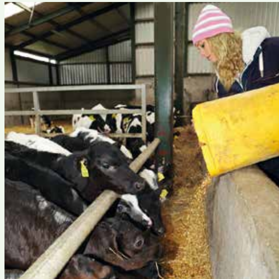
These calves have been successfully weaned and are now on a concentrate and hay diet with water ad lib .

Calves can be weaned once they are consistently consuming 1kg of concentrates per day. This level of intake can potentially be reached at an age of six weeks if access to palatable starter and water is available ad lib .