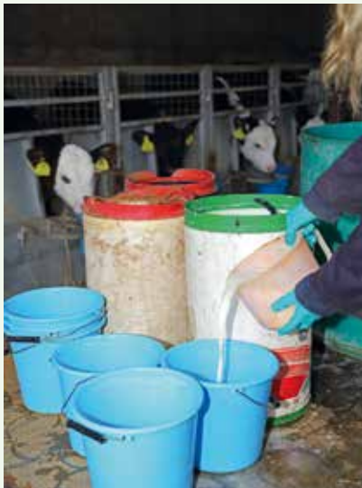
Whichever feeding method is used, each calf must receive the correct amount of milk daily.