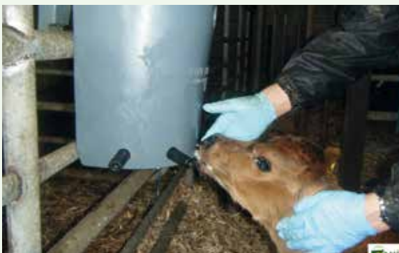
Training calves to drink requires both patience and skill. Let the calf suck your fingers and gradually guide the calf's mouth onto the teat or its nose to the milk in the bucket.

The speed that calves learn will differ; some calves learn quickly to come to the milk feeder, while others require more training. Gentle handling of hungry calves helps speed up independent feeding.