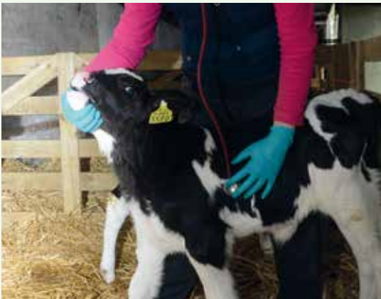
In severe pneumonia cases, veterinary intervention may be required.

Careful observation of calves at a time when they are resting is necessary to observe signs of ill-health. Checking the calves at feeding times only can reduce the likelihood of detection as the signs of pneumonia may not be so easy to observe at that time.