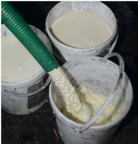
Milk replacer can be fed cold without reducing animal performance.