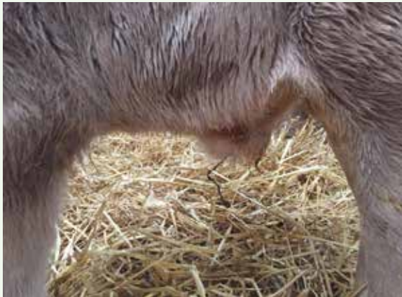
A healthy navel.