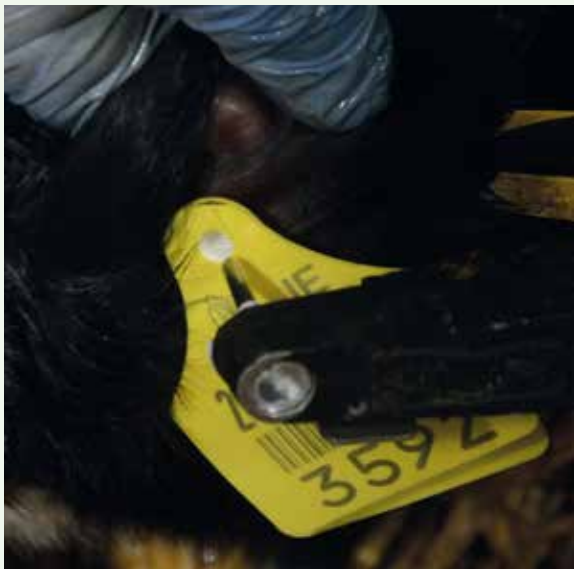
Ear notch testing is mandatory in newborn calves at registration and identifies infected animals.

Where individual animal testing has confirmed the presence of PI animals, these PIs should be isolated immediately and slaughtered at the earliest possible opportunity.