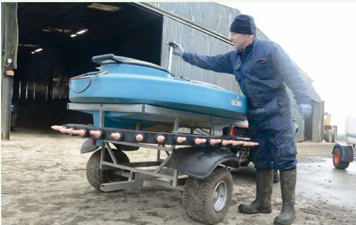
Excellent hygiene is essential to help prevent bloat.

The most important factor to control bloat is a consistent feeding program. Work with your vet to establish treatment programs so that cases of bloat get managed quickly and effectively.