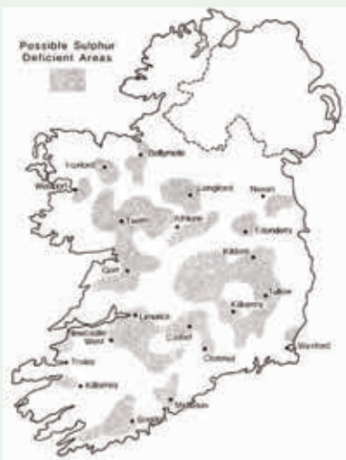
Figure 2. Map of Ireland showing sulphur deficient areas of the country. Shaded areas indicate where response to S fertilizer is more likely