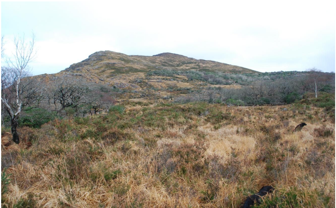
Accumulations of mixed fine fuels such as presented here, will cause very intense fires in dry conditions that are difficult to control. Fuel mixtures like this should only be burned where moisture conditions allow a slow burn rate and fire progression.

Landowners are strongly advised to seek NPWS advice on habitat and conservation issues during the planning phase.