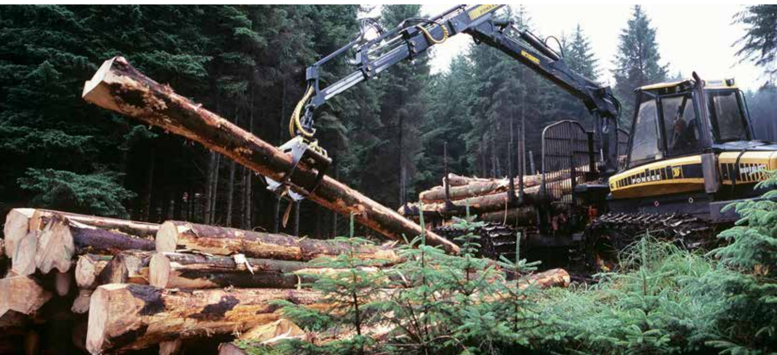
Photo 1 Regulated felling is key to realising, on a sustainable basis, previous and ongoing investment in Ireland's forests.

While this document makes reference to the Forestry Act 2014, it does not provide a comprehensive guide to this Act. Readers are referred to the Irish Statute Book for the full legal text of the Forestry Act and associated Forestry Regulations 2017 (see www.irishstatutebook.ie ).