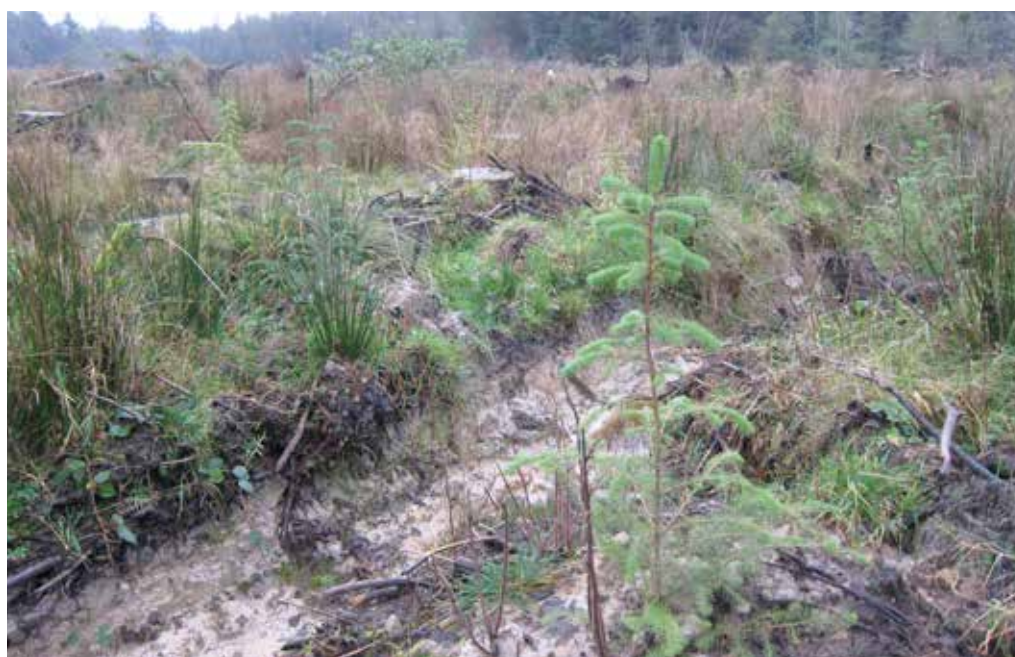
Photo 4 Reforestation with Sitka spruce for wood production (Objective CF). Slieve Blooms, Co. Offaly.