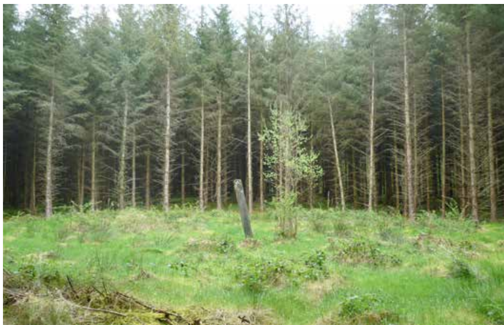
Photo 3 A standing stone within a setback created during thinning, in order to afford the Recorded Monument greater protection during future forest operations, to improve accessibility and to enhance visitor experience. Coillte's Kilpatrick Wood, Co. Westmeath.

and to associated features and artefacts. The early identification of the location, nature and extent of such archaeological sites and monuments or other important built heritage structures or features, the incorporation of these considerations into a site-specific felling plan, and subsequent due care during the execution of the planned operations, will all help to avoid or minimise the risk of any damage.