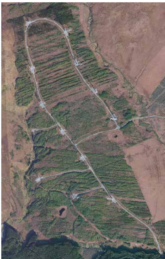
Photo 8 A wind farm within a forest plantation. Forest Service policy is to facilitate wind energy within the context of SFM and the expansion of the national forest estate.

In line with general Forest Service policy, where grant-aided forestry is to be used for wind farm development, any grants and premiums already paid out by the Forest Service in relation to the areas felled for the turbine bases, roads and infrastructure must be repaid where the forest is still in receipt of afforestation premiums and / or still in contract under the Afforestation Scheme.