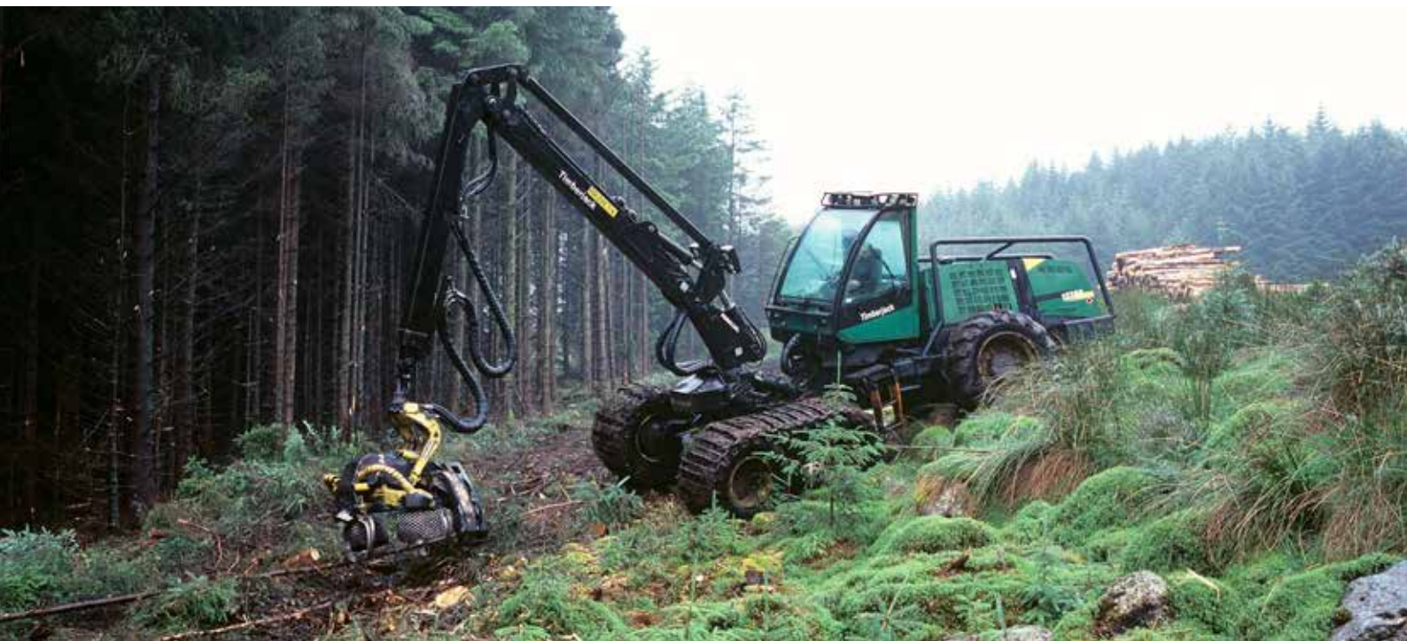
Photo 7 Clearfelling, Co. Wicklow. Circumstances exist whereby the permanent removal of trees and forests may be considered acceptable.

Note that Scenarios 1, 2, 3, 4 and 6 require the submission of a felling licence. Tree felling shall not commence until the Forest Service notifies the applicant that the permanent removal of trees is licensed.