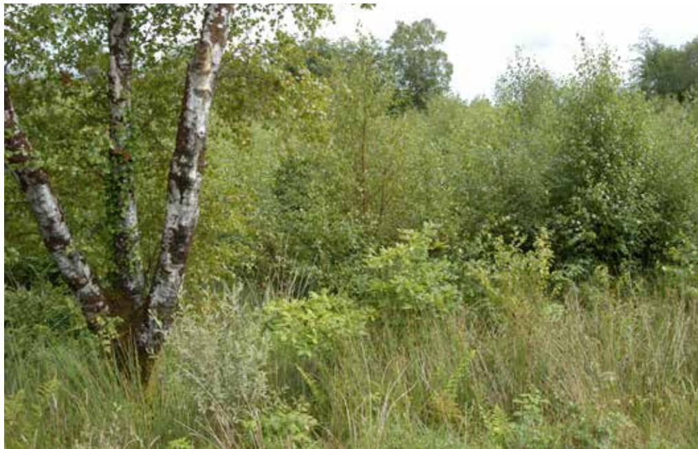
Photo 6 Where viable, natural regeneration can form part of Objective BIO.