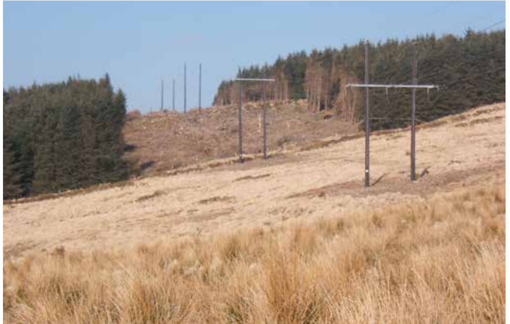
Photo 9 A newly-erected power line through felled forest. Various legislation may exempt such felling from the requirement for a Felling Licence.