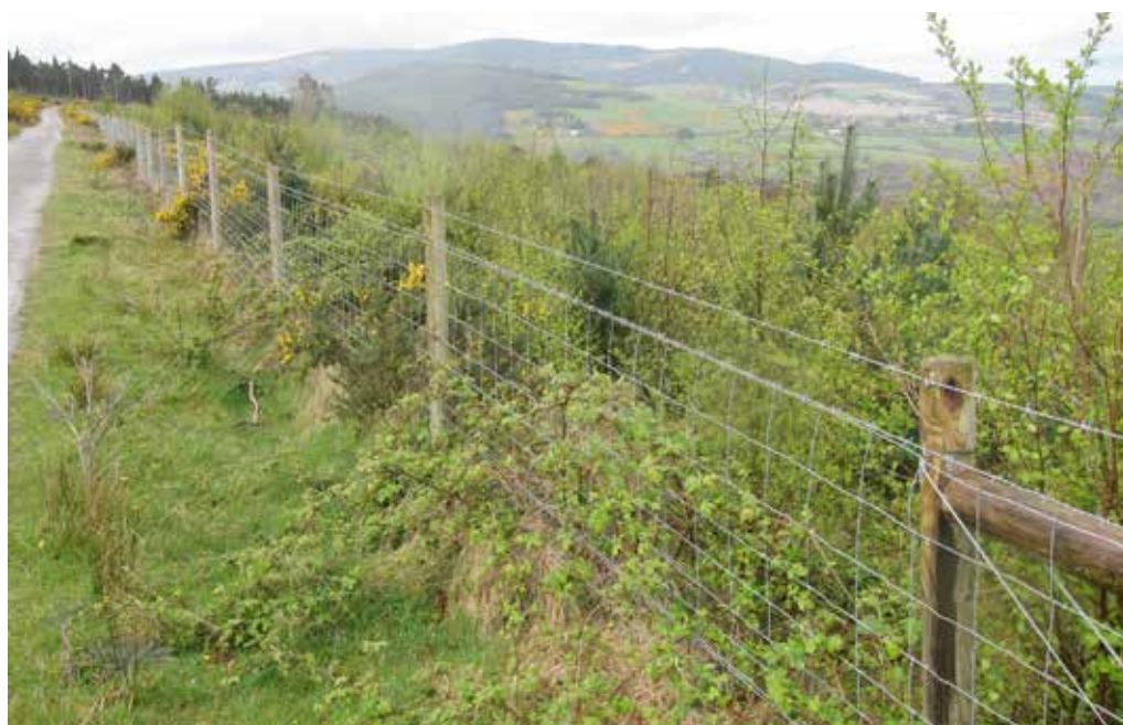
Photo 5 Reforestation with native woodland, to be managed as permanent forest cover (Objective CCF). Glencrees, Co. Wicklow.