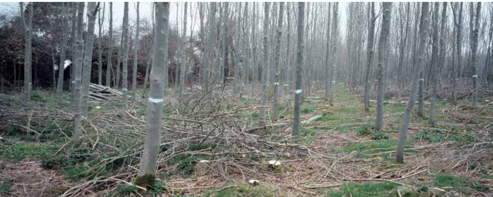
Photo 2 A well-thinned stand of ash, with future growth targeted on identified potential final crop trees.

Please note that if a licence has been granted subject to conditions, and the applicant has appealed against one or more of the conditions, no trees shall be felled or otherwise removed and, for the purposes of subsection 17.6 of the Forestry Act 2014, the licence shall be deemed not to have been granted, pending the final determination of all proceedings in respect of the conditions concerned.