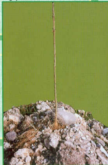
Poor planting; exposed roots