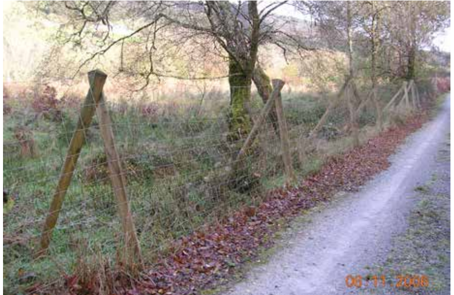
Photo 1 A-frame fencing and other alternative fencing and barriers, may be acceptable under NWS Conservation, on application.