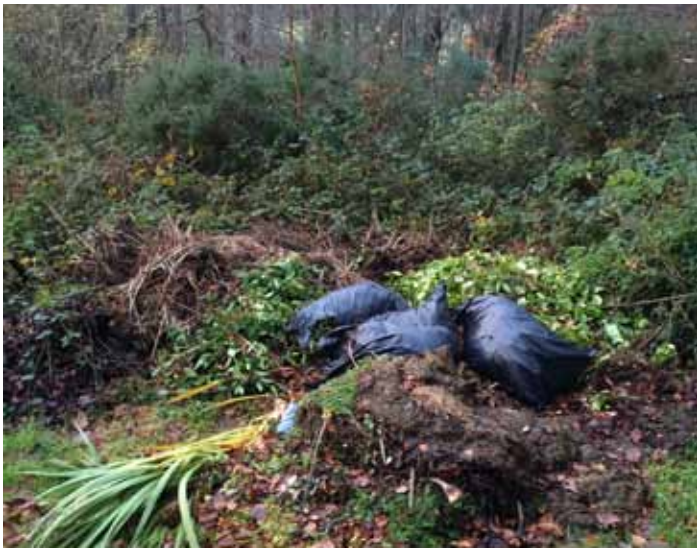
Figure 5 Illegal dumping of horticultural waste at a forest entrance