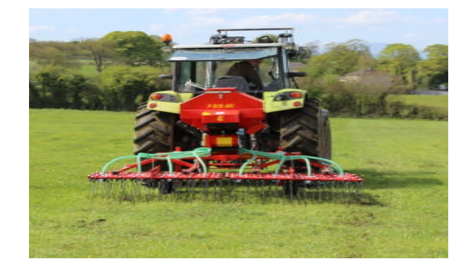
3m Einbock Pneumaticstar Seeder