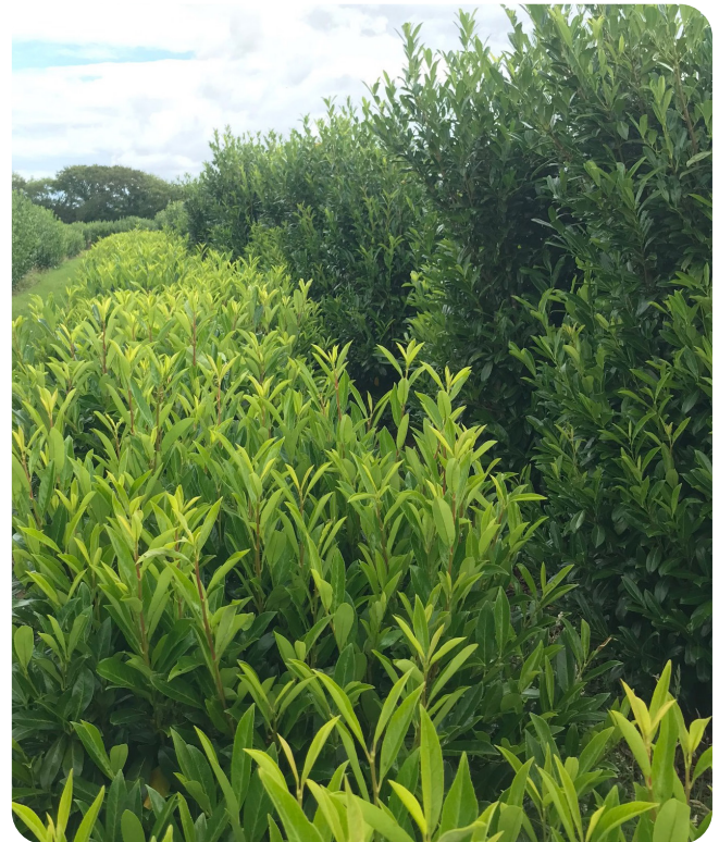
Prunus laurocerasus 'Caucasica' Pruned (L) and unpruned (R)

If the bushes grow out of shape or too high for hand harvesting, then a hard pruning to 1.2 m in spring will allow the crop to get back into the production cycle; however the first flush of stems after severe pruning are likely to be soft and susceptible to pest and disease attack as they take some time to build up metabolites that help boost the plants defence system. In this instance, a thorough program of plant protection may be necessary to ensure quality marketable stems.