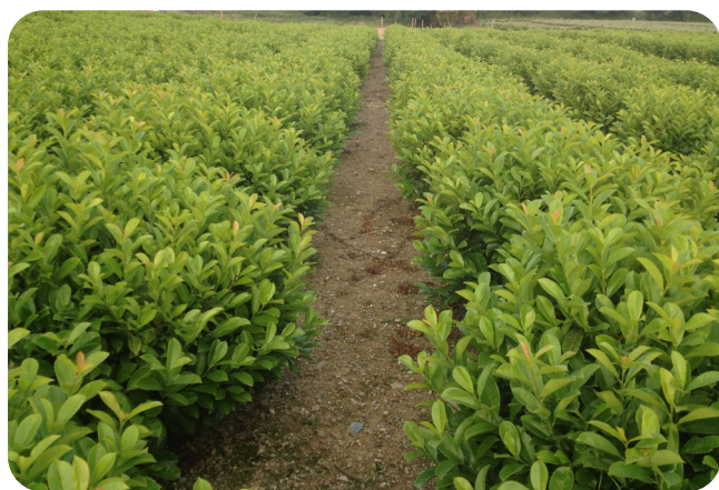
Cherry laurel plantation in south of Ireland

This factsheet has been prepared from the results of Teagasc trial work, the results of the DAFM 'New Leaves' project which focused specifically on pest & disease issues and recorded experiences of growers in the South of Ireland.