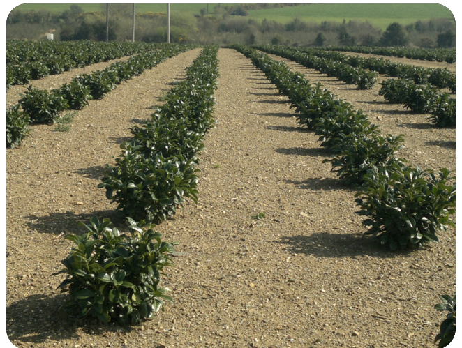
Field scale planting of P. l. 'Etna'

Planting is carried out in rows 2m apart, with plants also 2m apart in the row. This gives an overall plant density of approximately 2200 plants per ha (900 plants/ac). A 3m wide tramline should be left every 10-12 meters, depending on tractor and sprayer widths, to facilitate tractor operations and ease of harvesting. Higher density systems can be adopted but a more intense level of plantation management is then required.