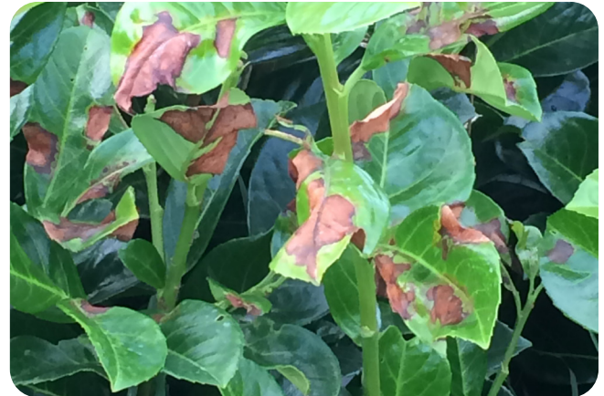
Downy mildew damage on cherry laurel

Potato blight warnings are a good indicator of when infection periods are likely. A preventative program is recommended in a high pressure season and one should consult an adviser on choice of fungicide.