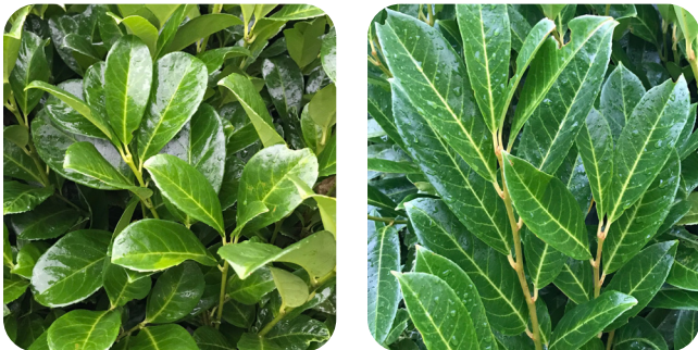
P. l. 'Etna' (L) and P. l. 'Caucasica' (R)

by short medium rounded, ovate, leathery shiny leaves that form on a dense bush. The arrangement of leaves at the top of stems in a whorl shape make it an excellent filler in a flower arrangements. P. l 'Caucasica' on the other hand has more erect stems and long, narrow, lanceolate leaves in an open bush habit. The more linear shape provides a different type of structural function in a floral product.