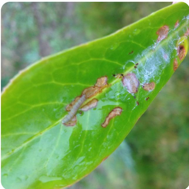
Typical Tortrix moth damage on Laurel

can result in small to large holes and subsequent growth leads to deformed leaves which can render stems unmarketable. Insecticidal treatments are justified where there are serious infestations and the pesticide choice should be carefully considered under an integrated pest management (IPM) approach to control. Consideration should be given to the contribution of beneficial insects within a plantation as they can play a valuable role in the fight against tortrix. Adult moths and the resulting damaging larva are usually active from late May-July and again from late August-October when both the adult and caterpillar are prey for many different predators. The larva are attacked by generalist predators that include bugs and fly larva and by the larvae of parasitic wasps. Typically, generalist predators are present in abundance in late June till the end of the growth season and the parasitoids are present when the larva are active on the foliage. Therefore in order to maintain a population of beneficial insects in high risk plantations, only insecticides compatible with an IPM system should be considered.