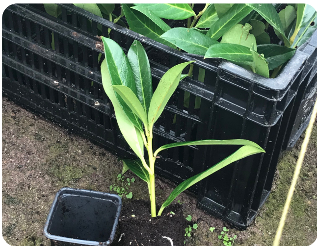
Plants of Prunus laurecerasus 'Caucasica' ready for field planting

Plants are supplied by specialist propagators. They are generally raised from cuttings which are taken in the autumn and well rooted plants in 7cm liners are usually ready for planting out 6-8 months later.