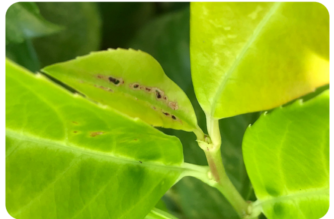
Thrips damage on cherry laurel.

Thrips ( Thrips flavus ) which is the yellow flower thrips can be a pest of laurel. The young larval stages tend to feed in the enclosed shoot tips and the resultant damage takes the form of a speckling where the epidermis is heavily scratched at either side of the mid rib of leaves as the young shoots unfold. In severe cases, some holes may result but it is thought to be rare. It is suggested that the damage may be an entry point for bacterial pathogens such as Pseudomonas syringae . The IPM approach to control as outlined for tortrix moth should be considered in controlling thrips.