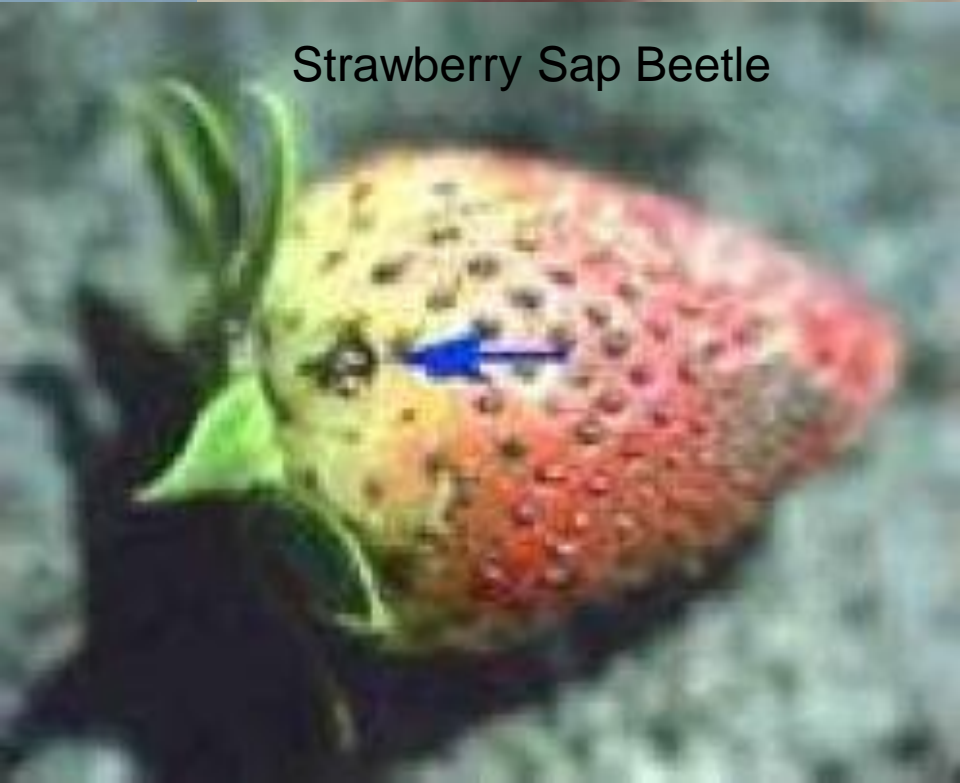
Strawberry Sap Beetle