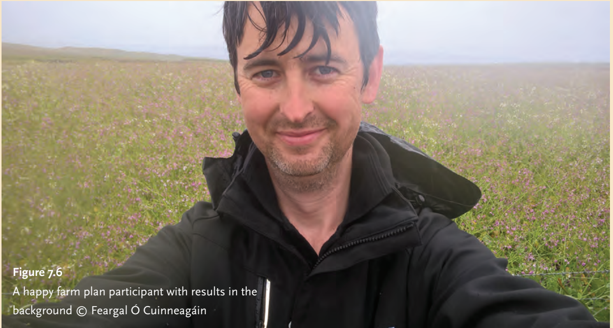
Figure 7.6 A happy farm plan participant with results in the background

exposed coastal landscape. In response to this, the plan set about creating Early and Late cover (ELC) plots. If Corncrake arrive onsite, mowing is delayed until late summer. The centre-out mowing is used and a generous headland remains uncut and this and the ELC margin provide a refuge for broods to escape into cover safely. For Twite and other farmland birds, a cereal/brassica mix such as kale, mustard or radish and triticale was sown. This creates both a Summer/Autumn crop and a Winter crop producing bird seed of different sizes, insect food and cover while doing so in the ‘hungry gap’, the late Winter/ early Spring period. The plan adopts a holistic approach, creating the traditional agricultural habitat mosaic and restoring natural habitats on the farm.”