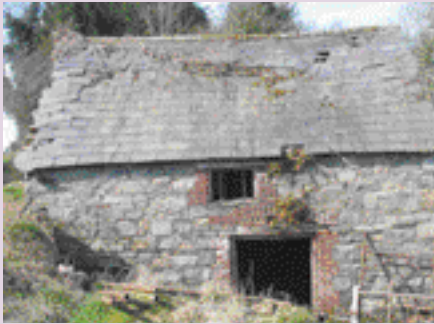
Roof spaces are likely bat roosts

Farmland provides important habitat for feeding and roosting bats. Bats fly along linear features, avoiding open spaces. Hedgerows and treelines are essential in providing connectivity in the landscape.