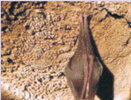
Hibernating Lesser Horseshoe bat