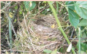
Song thrush Nest