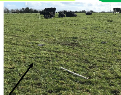
Cows at Teagasc Johnstown Castle doing a great job cleaning out paddocks. Pre-grazing yield was 1250 Kg/DM/Ha