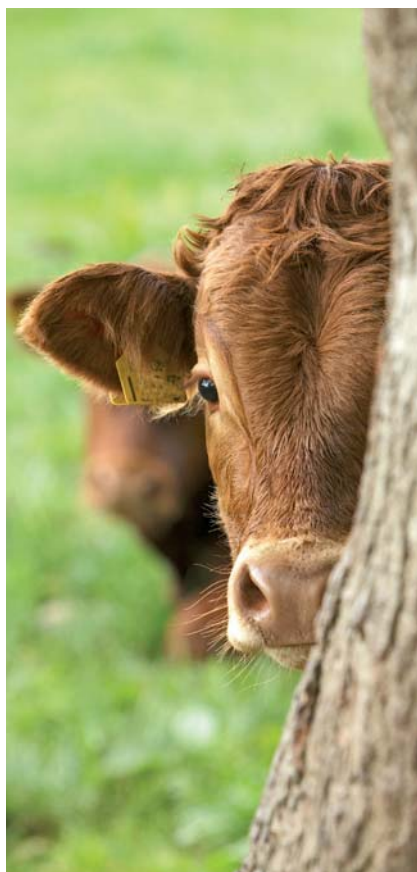
Approximately 26,500 farms in Ireland are signed up to the (BDGP).

Which category does your herd fall into? On the ground, we are broadly seeing that herds are falling into one of three categories when they examine their BDGP report.