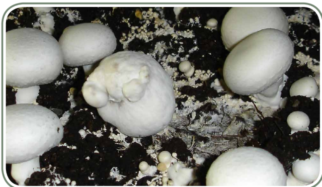
3. Wart-like growths due to Lecanicillium