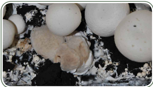
2. Dry Bubble developing in a crop

A number of different symptoms occur depending on the time of infection. Small bubbles of tissue develop when mushroom pins are infected at a very early stage. When infection occurs during early mushroom development, then split stipes and partial mushroom malformations can develop. Wart-like growths can occur on the cap when older developing mushrooms are infected. When fully formed mushrooms are infected, for example, by water splash or flies, then grey-brown spots can develop on the mushroom caps.