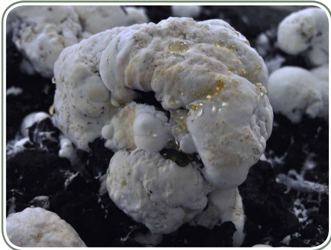
5. Malformed mushrooms due to Mycogone

of amber colored liquid can appear on the surface of the bubbles and the tissue gets soft and rotten. In severe cases, white mycelium can grow out onto the surrounding casing which will turn brown as the spores mature.