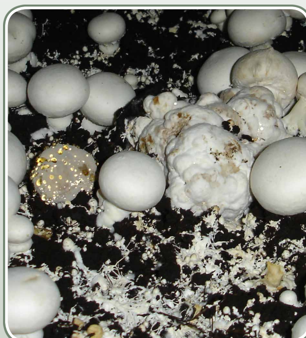
1. Mushroom crop affected by Mycogone