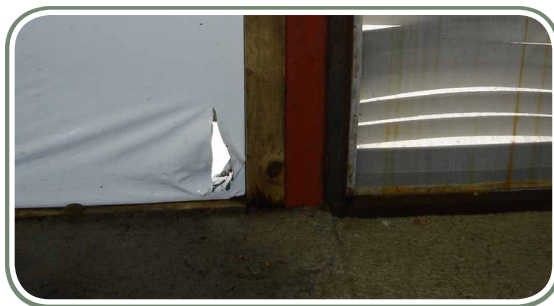
7. Torn plastic covering on end wall

to break the connection with the casing to stop them growing. Check treated areas regularly to make sure there has been no regrowth nearby.