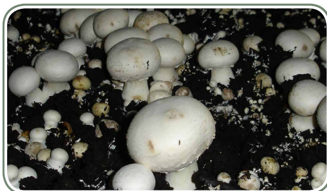
4. Grey-brown spots due to water splash

Once the disease is established on the farm, there is a continuous supply of sticky spores that can cause a continuous cycle of disease symptoms, if left untreated.