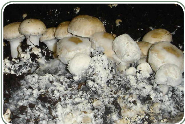
6. Cobweb growing over brown mushrooms

The primary symptom of Cobweb Disease is circular patches of cottony white cobweb-like mycelium growing over casing soil and enveloping mushrooms in its path. The mycelium infects the mushrooms, which can cause them to discolour. Cobweb spores that land on nearby developing mushrooms will cause them to develop brown irregular spotting symptoms, either while they are still growing on the bed or post-harvest.