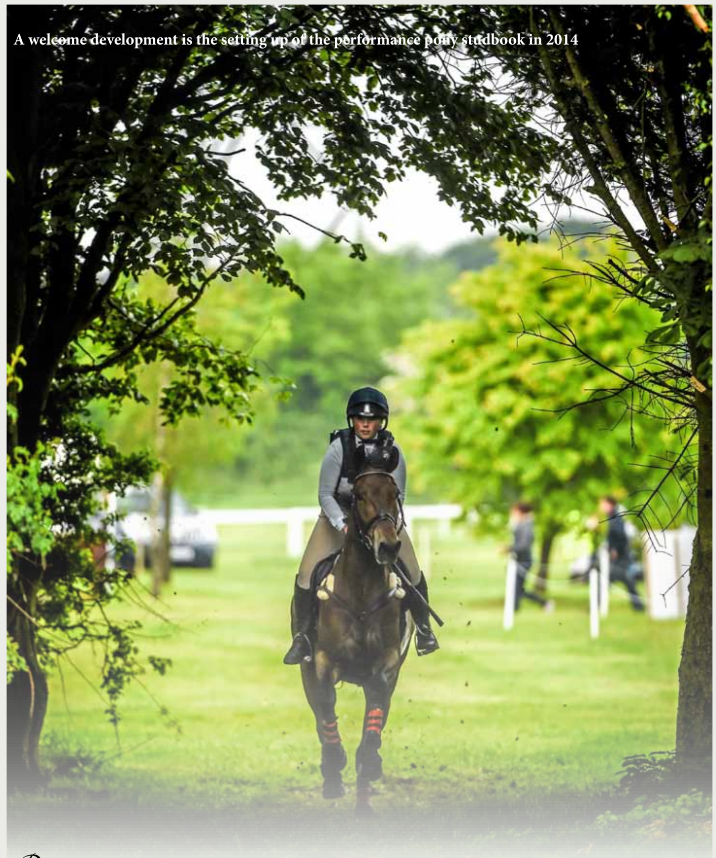
R1.8 Develop a breeding plan, infrastructure and knowledge transfer in relation to ponies

Gathering information on pedigrees of performance ponies and breeding from lines of performers needs to be adopted. It would be useful to apply the same methodology approach to the pony sector as is being advocated for the sports horses. Building a databank of information in relation to ponies would help to provide supporting evidence regarding which ponies are adding value in terms of performance characteristics. Making this information widely available to pony breeders and producers would help to facilitate future breeding decisions.