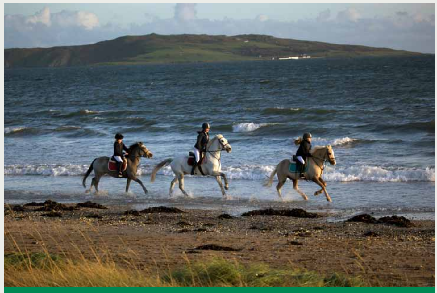
In 2012, overseas visitors, who engaged in equestrian activities while in Ireland, spent an estimated €79 million