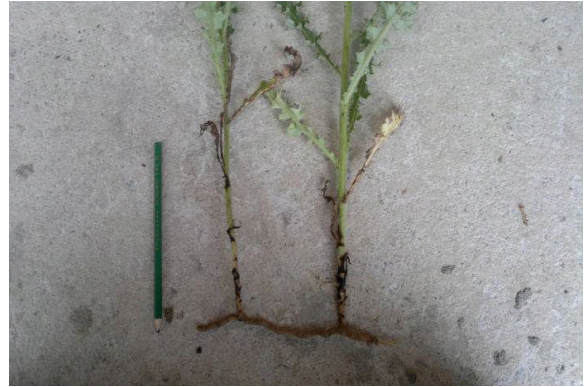
Mature Creeping Thistle

Left: Creeping Thistle re-growth from old roots Right: Creeping Thistle from seed Note difference in leaf shape and also in root system