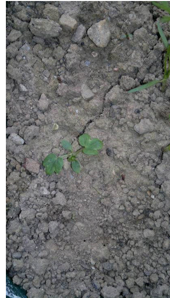
Photo taken 5 weeks after re-seeding