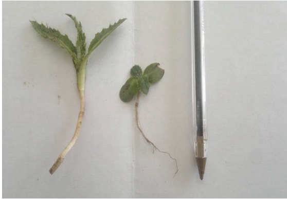
Seedling Creeping Thistles

Left: Creeping Thistle re-growth from old roots Right: Creeping Thistle from seed Note difference in leaf shape and also in root system