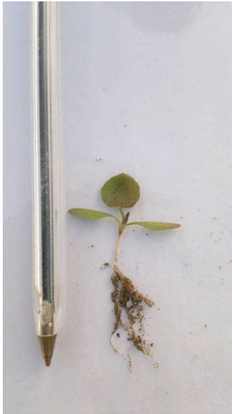
Photo taken 5 weeks after re-seeding