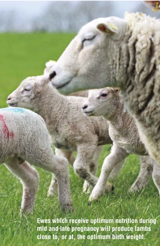
Ewes which receive optimum nutrition during mid and late pregnancy will produce lambs close to, or at, the optimum birth weight.

protein (soya, rapeseed), energy (maize, barley) and fibre (beet pulp, soya hulls) sources. While concentrate price is important, it's worth bearing in mind that when offering similar levels of concentrate to ewes during late pregnancy as is offered at Teagasc Athenry, a reduction in concentrate price of €20/t equates to a saving equivalent of only 40c per ewe.