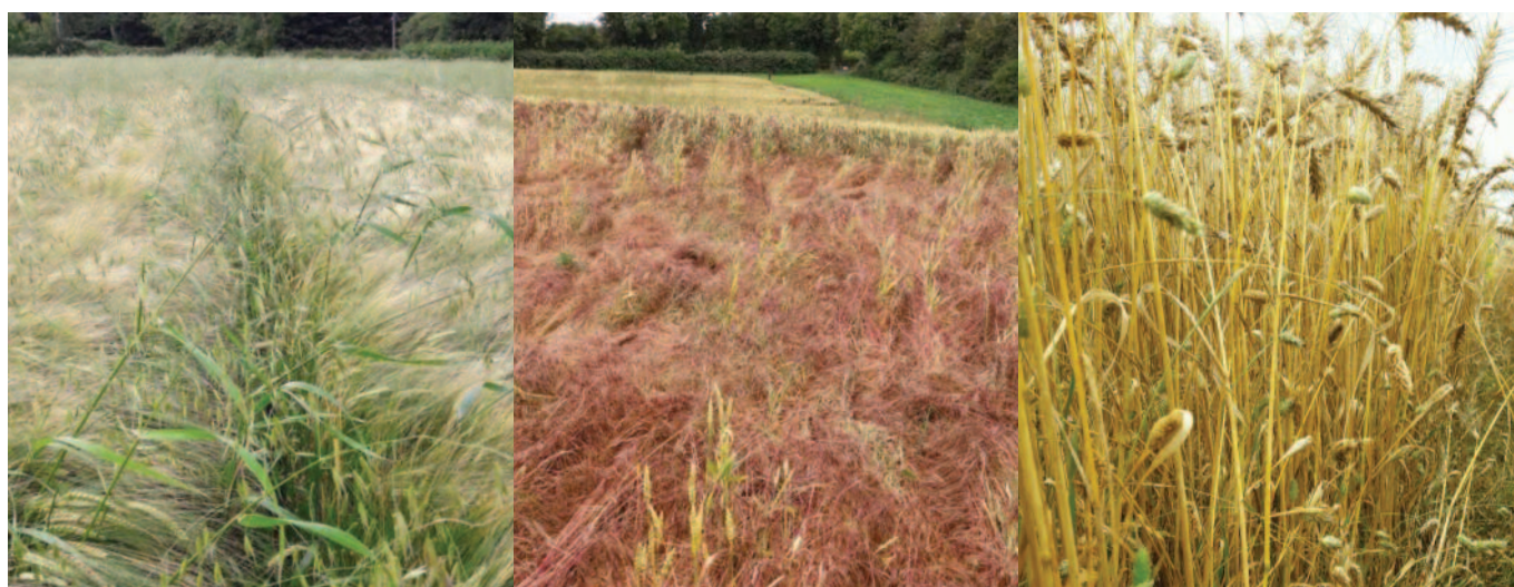
FIGURE 1: From left: infestation of wild oats ( Avena fatua ) in spring barley; sterile brome ( Bromus sterilis ) in winter wheat; and, lesser canary grass ( Phalaris minor ) in spring wheat.

Before making absolute statements about the levels/presence of resistance in Irish grass weeds, more analysis is certainly required. This survey is being carried on in 2017 and 2018. That said, initial findings