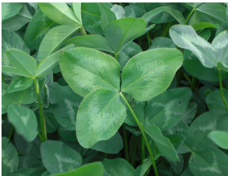
Red clover can fix 150 - 200 kgN/ha

Clover is the cornerstone of organic farming and the engine that drives productivity. White clover ( Trifolium repens L.) and red clover ( Trifolium pratense L.) are the main clover species used in Ireland. However, there are several significant differences between the two species particularly in morphology and physiology. In contrast to white clover, red clover has an upright growth habit and a strong deep root from which finer roots arise. The crown, located at the base of the stem, acts as a store of nutrients. Stems of red clover grow upwards from the crown. The optimum management and use of red clover is significantly different from that of white clover. The main role of red clover is for silage production.