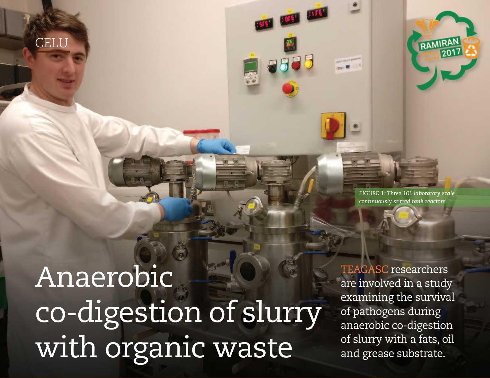
FIGURE 1: Three 10L laboratory scale continuously stirred tank reactors.