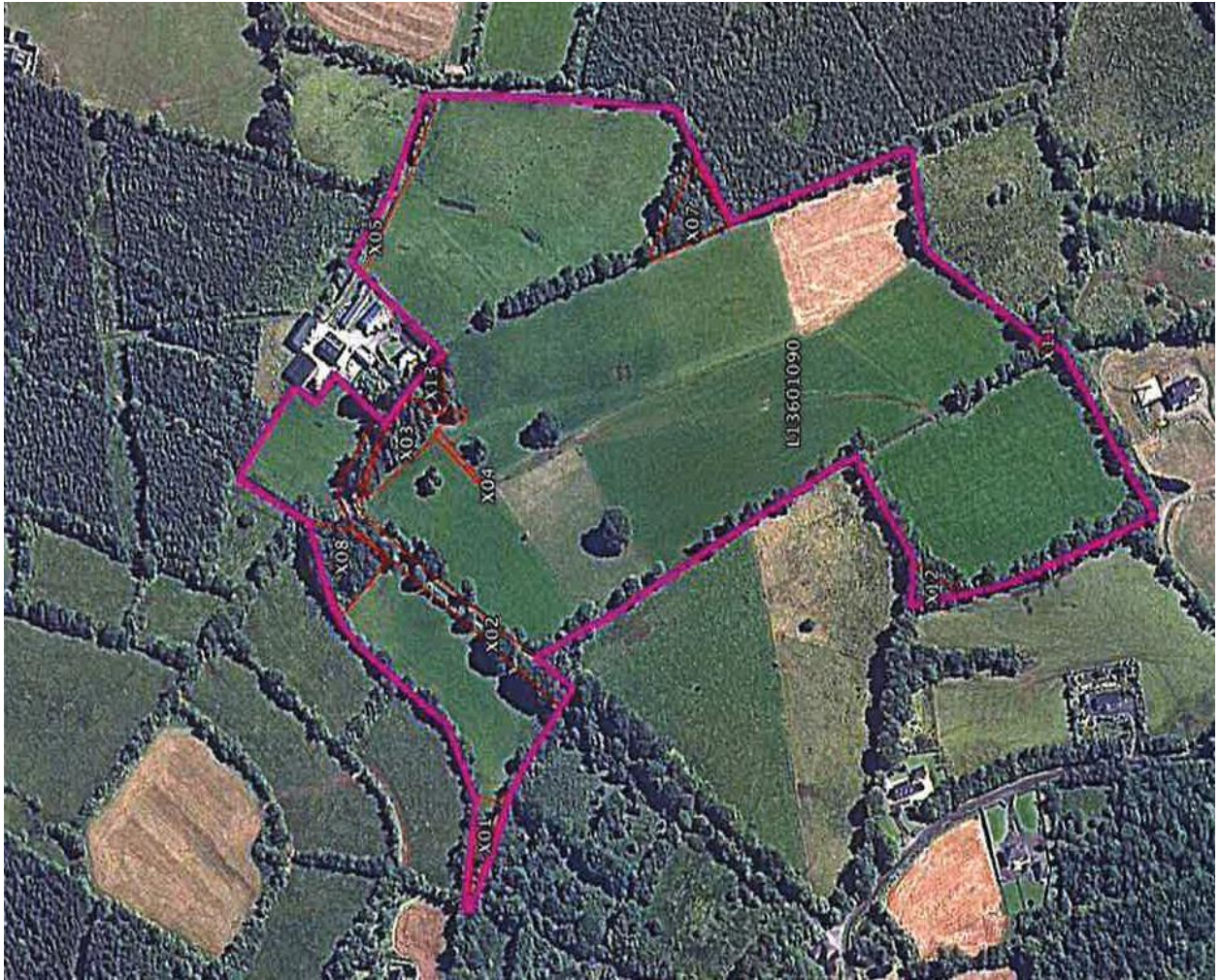
Figure 2. Farm map for farm in Cloverhill (Home Farm)