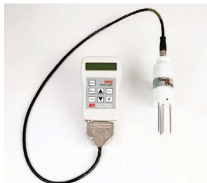
Figure 3: Soil moisture probe.

Oversowing with grass seed can benefit severely poached swards. Using a lighter breed of cow (jersey crossbred) offers a marginal advantage in avoiding damage. We have found the impact of rolling a poached sward to be far more damaging than the original poaching. Grass will grow equally well on a rough surface