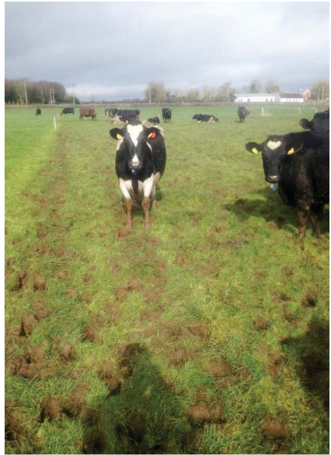
Figure 1: Pre-grazing sward showing ponding at the soil surface in low lying parts of the paddock and cows out fulltime on pasture on 23 February 2016.

has shown that there is little or no poaching damage when the soil water content is at or below 50%. Poaching damage progressively increases with increasing soil wetness above 50%.