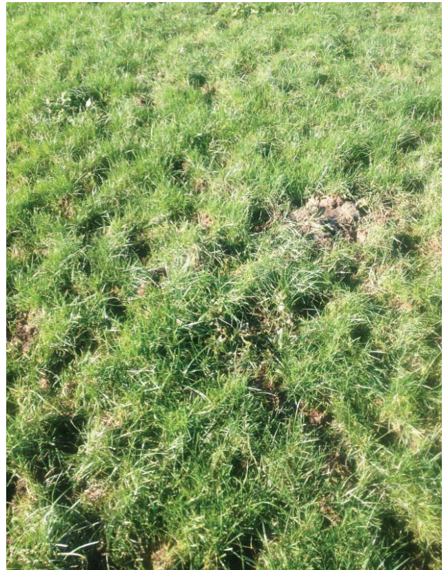
Figure 2: Post-grazing damage and recovery of the sward seven days later.

very high in the early spring and autumn, longer rotations (42 days or so) at these times of the year means that the sward has a longer time to recover between grazings and this has a big bearing on subsequent pasture productivity. Likewise pastures badly poached in the autumn have plenty of time to recover during the winter to full productivity by the spring.