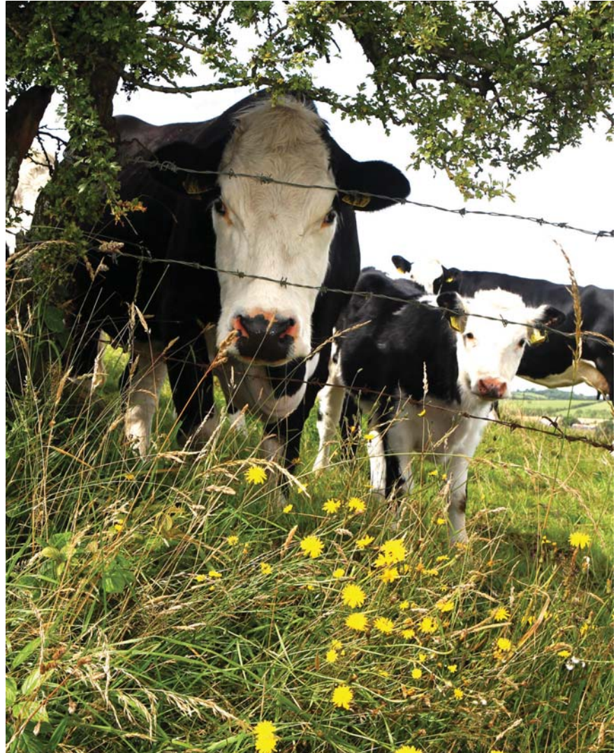
Dandelions: for some a weed, for others a trigger for precious childhood memories.