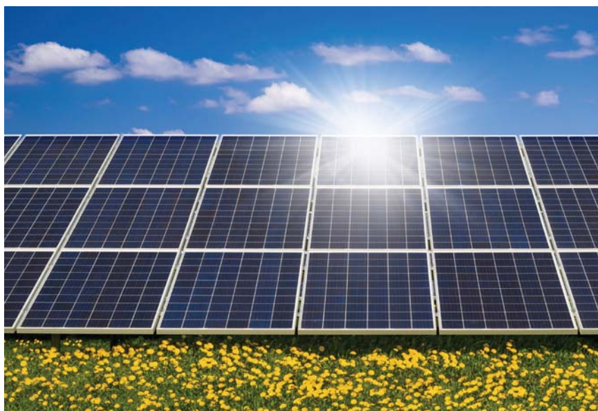
Agricultural land leased out for the purposes of siting solar infrastructure will continue to be classified as agricultural land and so will be an eligible chargeable asset for retirement relief.

and with a view to the realisation of profits.