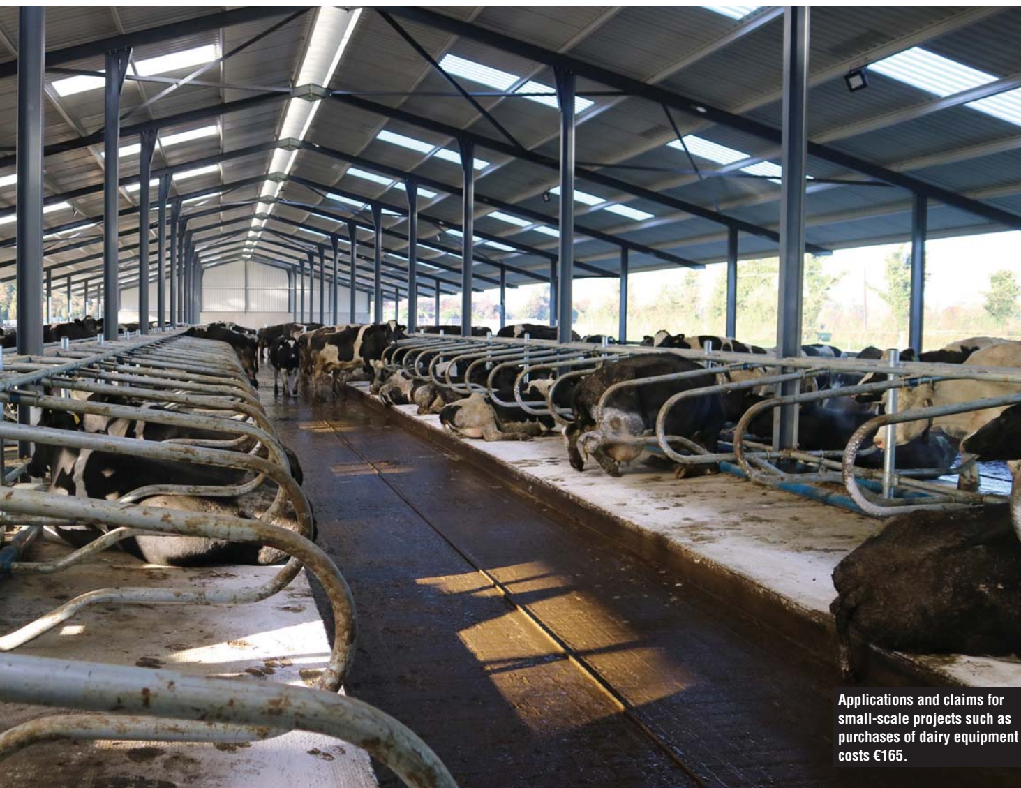
Applications and claims for small-scale projects such as purchases of dairy equipment costs €165.