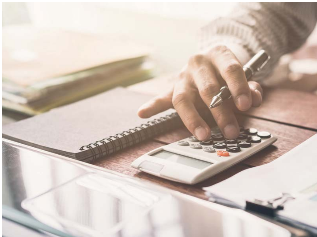
Table 1: Income tax standard rate bands

The lower exemption threshold above which income becomes liable to the USC will remain at €13,000