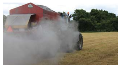
Only apply lime based on a recent soil test result. Over-application of lime will reduce the availability of soil P.

Please contact your local Teagasc advisor to plan soil-sampling requirements.