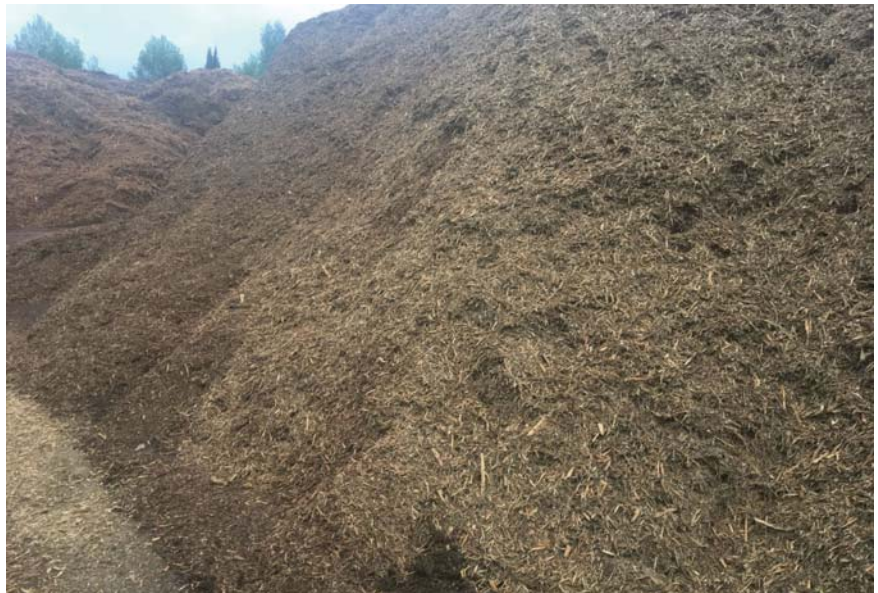
Biotechnology will transform biomass from waste product to valuable industrial raw material.

The plant is primarily a waste management facility and depends on gate fees for organic waste. The Spanish government pays a carbon premium of €7/t of CO 2 based on verified reductions in carbon emis-