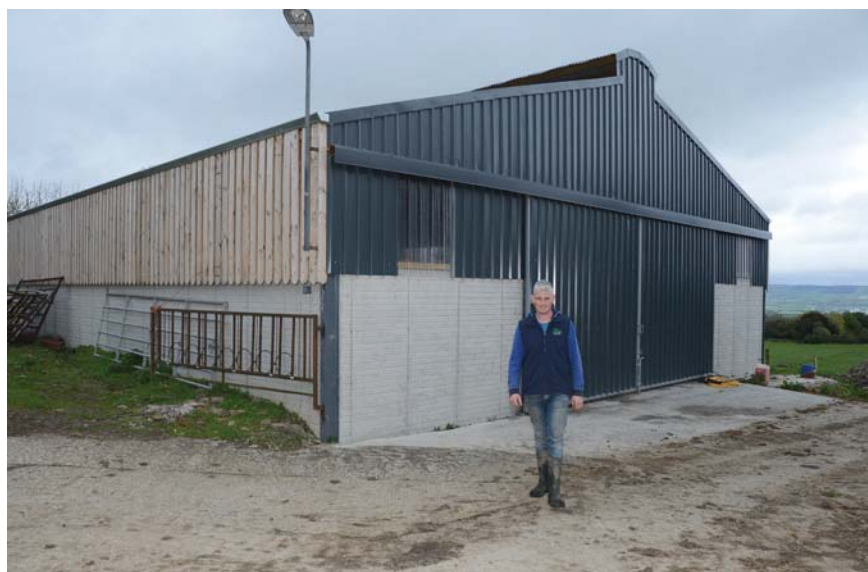
There is plenty of space around the new building.

ing in the roof may well have been worthwhile.” Additional artificial lightning has been provided at calf level to aid inspection.