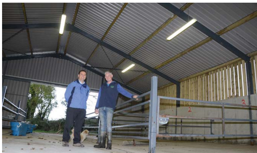
A roof pitch of 17°, a sloping floor, Yorkshire boarding and a solid rear wall are key features.