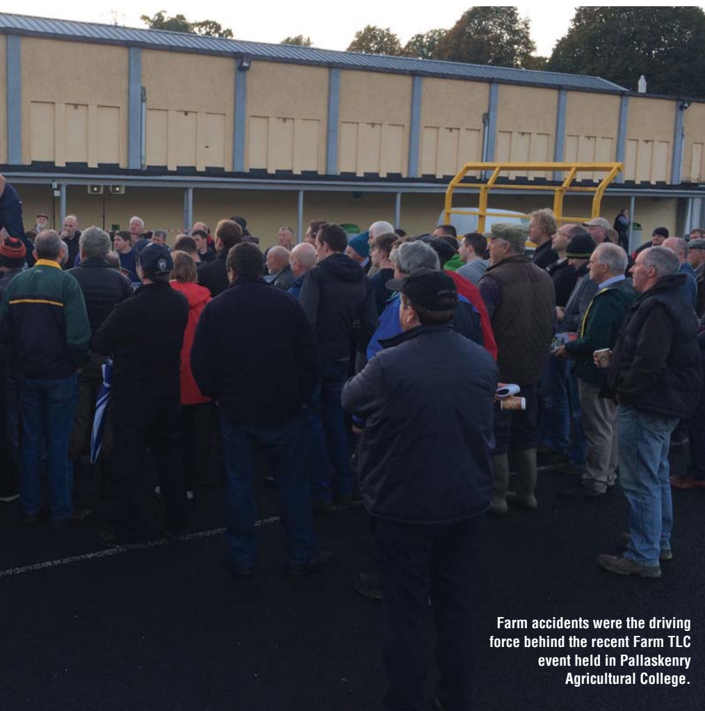
Farm accidents were the driving force behind the recent Farm TLC event held in Pallaskenry Agricultural College.

tions concerning trailer use that are frequently flaunted. The laws and licensing for trailer use are complicated. Many drivers are towing trailers without the proper licence, despite the risk of incurring penalty points and potentially voiding their insurance cover. He emphasised that when it comes to trailer use, weight is a common area of non-compliance.