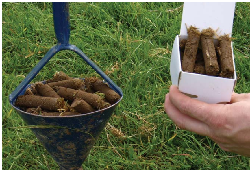
Ensure correct soil sampling depth for accurate soil P reading.

shows the target pH levels required for a range of different crop types.