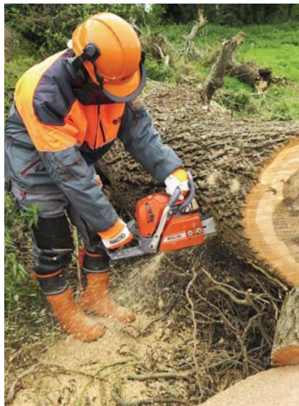
Protective clothing is a must for chainsaw operators.

Farming with TLC will promote respect for health and safety. TLC also