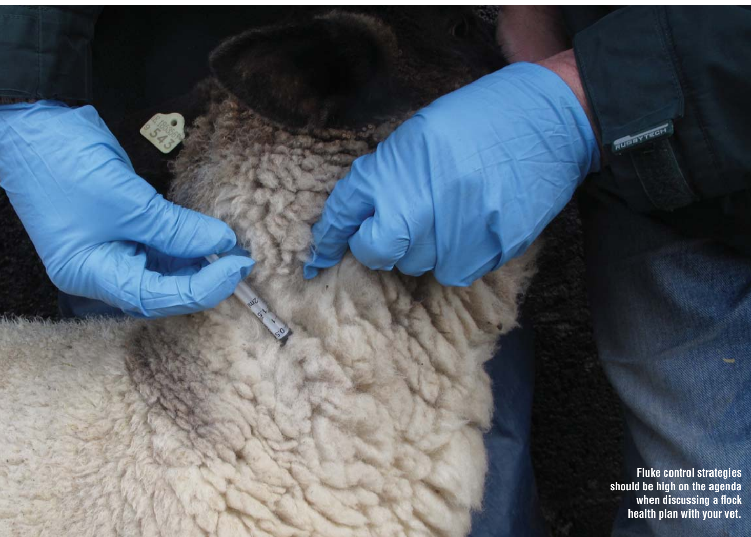
Fluke control strategies should be high on the agenda when discussing a flock health plan with your vet.

stage of development. The presence of rumen fluke eggs in the sample does not always warrant treatment. Consult your vet in relation to this.