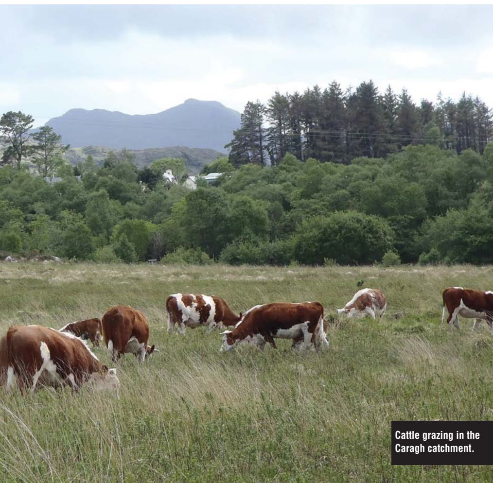
Cattle grazing in the Caragh catchment.

There are at least 96 individual populations of FWPMs in the Republic of Ireland and, of these, 27 rivers have been designated as Special Areas of Conservation. However, there has been a decline of freshwater pearl mussel populations, mainly due to the continuous failure to reproduce new generations of mussels.