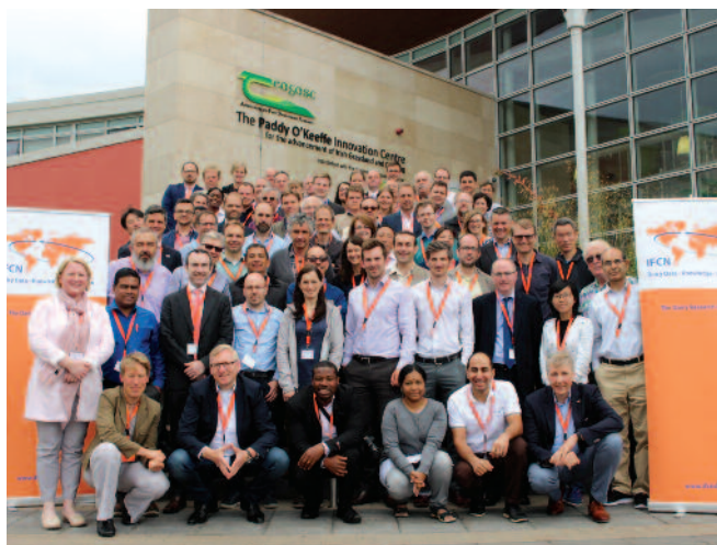
Participants at the IFCN Dairy Conference 2018.