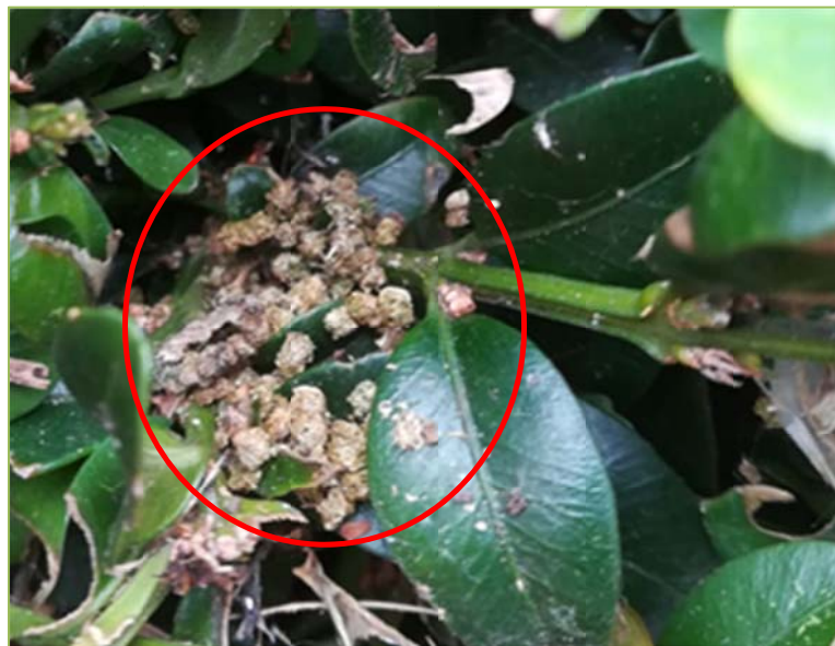
Figure 3. Accumulation of Insect frass (waste) observed on a mature planting of Buxus spp. in South Dublin, Ireland in 2018.