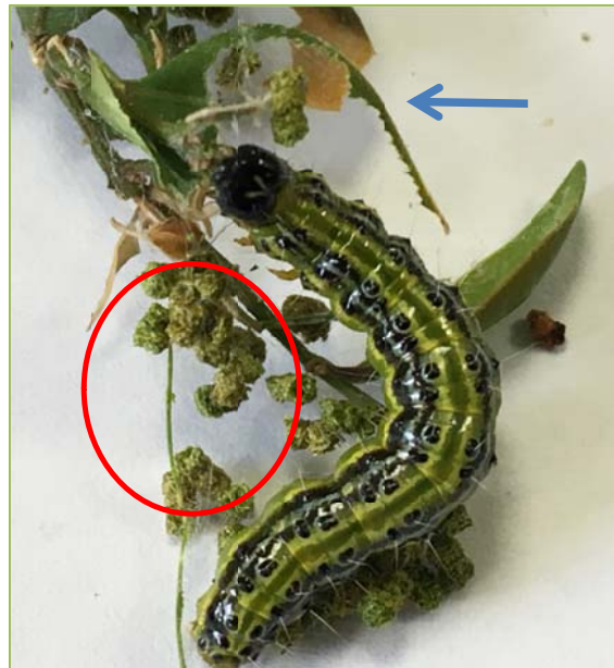
Figure 5. Mature larva of box tree moth ( C. perspectalis ) feeding on Buxus spp. Note the large amounts of insect frass (waste) produced (red circle) and characteristic feeding habit which leave the leaf margin intact (Blue arrow)

Young caterpillars overwinter in a cocoon built from webbing, constructed between leaves (Fig 6). The caterpillars enter into diapause (resting phase) in autumn triggered as temperature and day length decrease. Caterpillars begin feeding again in spring. It is estimated, based on climatic modelling that the moth will have between one and two generations per year in Ireland, similar to the predictions for the north of England (Nacambo et al., 2014). Up to 4 generations can develop in warmer climates and in the south of England up to three generations have been observed in 2018.