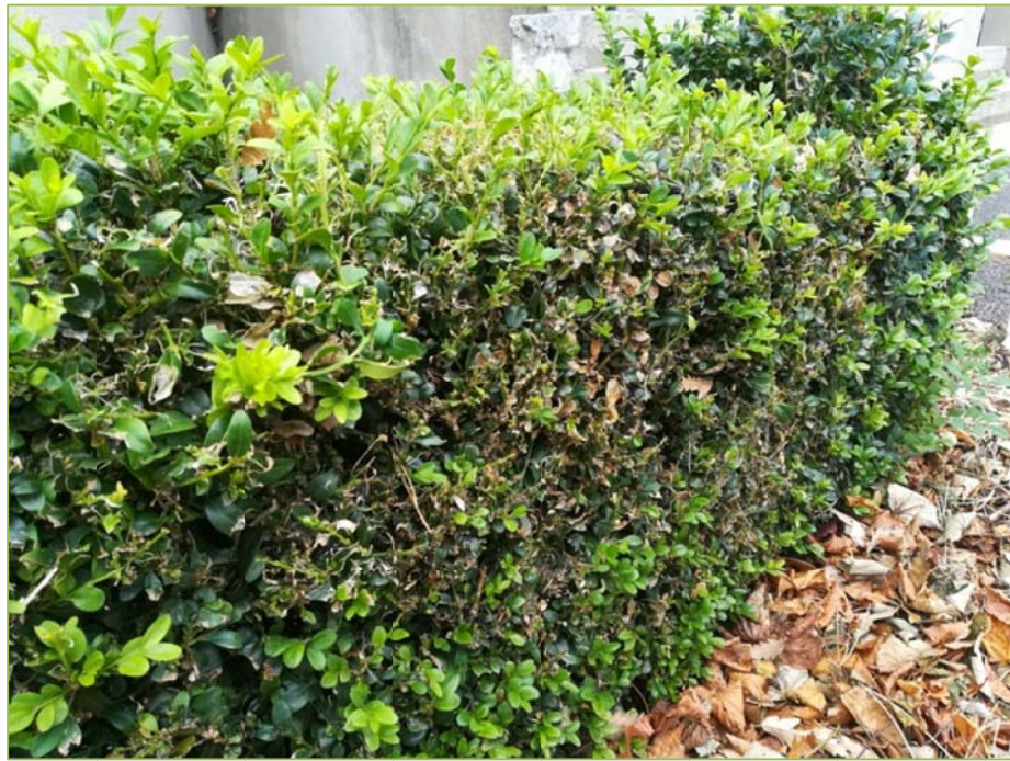
Figure 2. Feeding damage to Buxus hedge caused by box tree moth larval feeding

As stated, this insect originates from East Asia and was first discovered in South-western Germany and the Netherlands in 2007. It has since spread to most of Europe except for northern Scandinavian countries. C. perspectalis tolerates relatively low temperatures and is very mobile. As the moth is not native to Europe, it has few predators, possibly due to the build-up of toxic alkaloids from their host-plant. So far very few parasites have been found and so it has been readily able to establish limited only by abiotic factors.