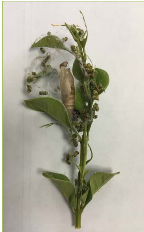
Figure 7. Webbing, frass and chrysalis of box-tree moth