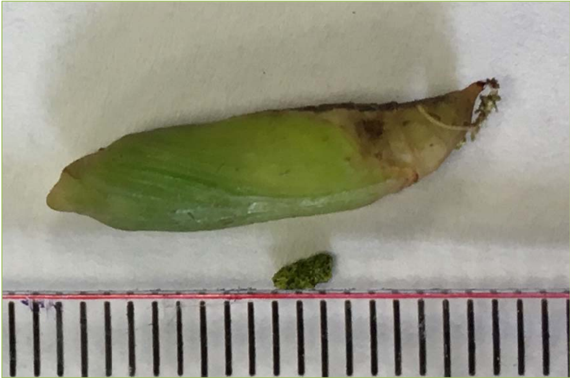
Figure 8. Chrysalis of box-tree moth ( C. perspectalis ). The chrysalis can often be observed within the webbing created by the larva, which attaches it to the plant