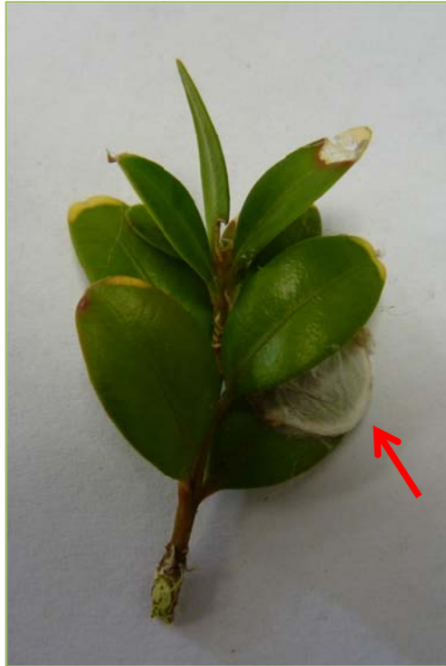
Figure 6. Overwintering cocoon of an immature box tree moth larvae (Red arrow)