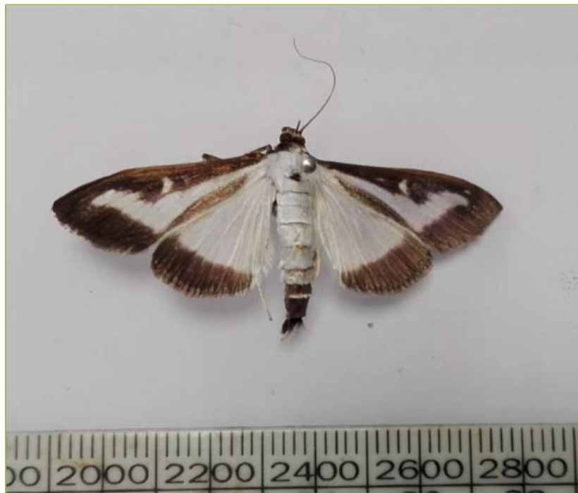
Figure 9. Adult box tree moth ( C. perspectalis ) recovered from a chrysalis collected from a mature Buxus planting in Dublin in September 2018