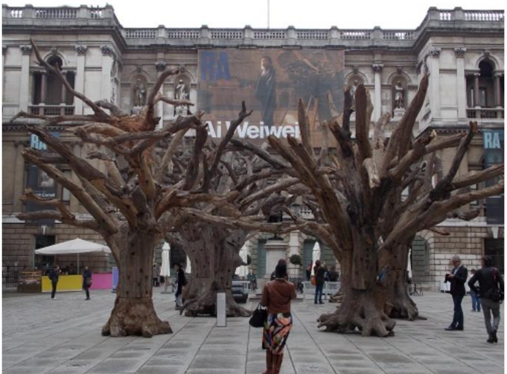
A Chinese Major artist and cultural phenomenon Ai Weiwei takes over the main galleries of the Royal Academy of Arts with his exceptionally thought provoking and visionary works.