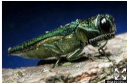
Emerald Ash Borer ( Agrilus plannipennis )