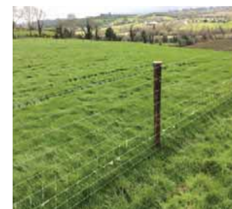
An example of some the fencing done by Tomás to improve his grazing infrastructure (below).