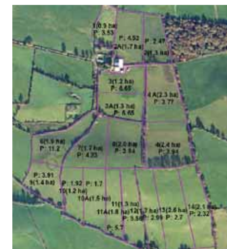
Farm map of Tomás's main grazing block (above).

The high output flock is made up of Belclare and Suffolk cross ewes and is consistently achieving litter sizes between 2.0-2.2 lambs per ewe for the mature stock.