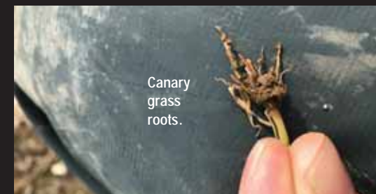
Canary grass roots.