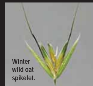
Winter wild oat spikelet.