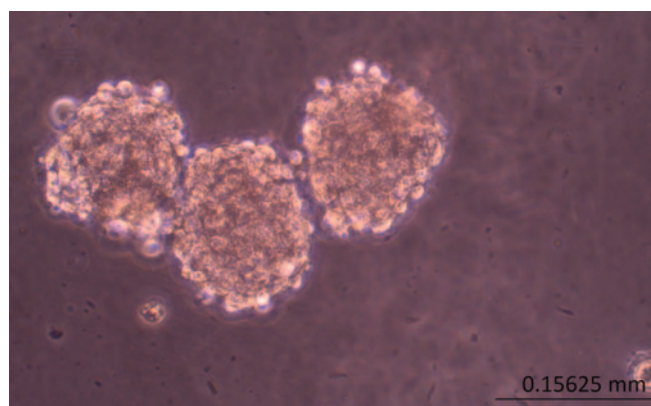
FIGURE 1: 2D (left) and 3D (right) cell cultures of U373MG cells.

are specialised culture plates with ultra-low attachment coating (polyhydroxyethylmethacrylate/agarose), which promote cell aggregation to form spheroids. Hanging drop plates are open bottomless wells, which promote the formation of droplets of media that provide space to form spheroids. In magnetic levitation, cells are preloaded with magnetic nanoparticles and external magnetic fields to provide non-adhesion, plate-like properties to form uniform tumourspheres. A rotational stirrer has a container to hold cells and impeller, stirring continuously. Liquid flow prevents cell adhesion and distributes nutrition and oxygen uniformly to form tumourspheres.