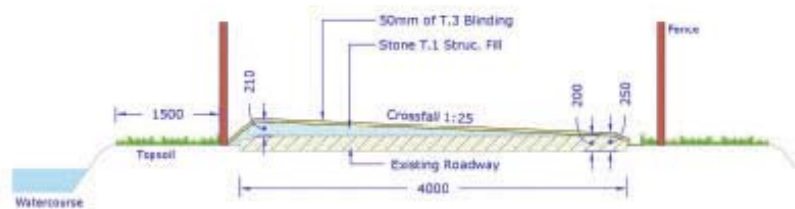
Figure 1- Farm Roadway resurfaced with T.1 Struc. fill and dust to a 1:25 crossfall away from stream