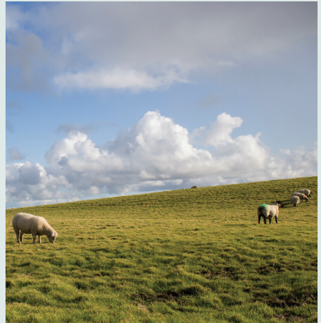
Grass growth was very strong during July and August.