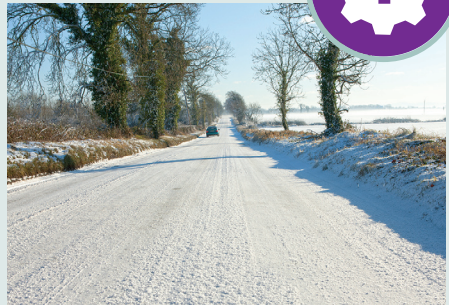
Be winter ready.

From mid September onwards is the ideal time to focus on getting winter ready. In recent years, storms, flooding, snow and ice have become more frequent in winter. Now is the time to do winter-ready maintenance around the farm. For example, check for buildings or trees that could collapse. Check your supplies, e.g., anti-slip grit, protective clothing and equipment, torch batteries and first-aid boxes. Make sure to have your emergency contacts up to date and accessible and that your Eircode is displayed in a prominent place. Further