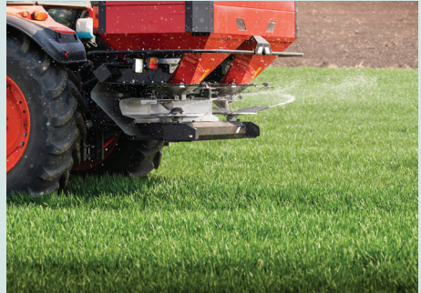
Nitrogen application will encourage good autumn grass growth.

Lamb growth rates for the past month have been in the region of 140g/day (grass only) to 160g/day (grass and white clover), with 26% of lambs drafted from grass-only groups and 32% from grass and white clover groups up to mid August. Average liveweight for lambs drafted to date was 43.8kg, with average carcass weight 19.7kg. This represents an average kill-out percentage of 45%. While grass growth rates have been good, averaging 75kg DM/ha/day for July and August, grass dry matter content has reduced greatly in the last few weeks, which is impacting on lamb performance. Rainfall levels in Athenry for July were over 200% of normal levels at 174mm. To date, 85% of the total nitrogen (N) allowance for both the high (145kg N/ha) and low (90kg N/ha) N treatments has been spread. The final round of N was applied in late August to ensure adequate grass growth