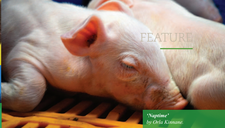
'Naptime' by Orla Kinnane.