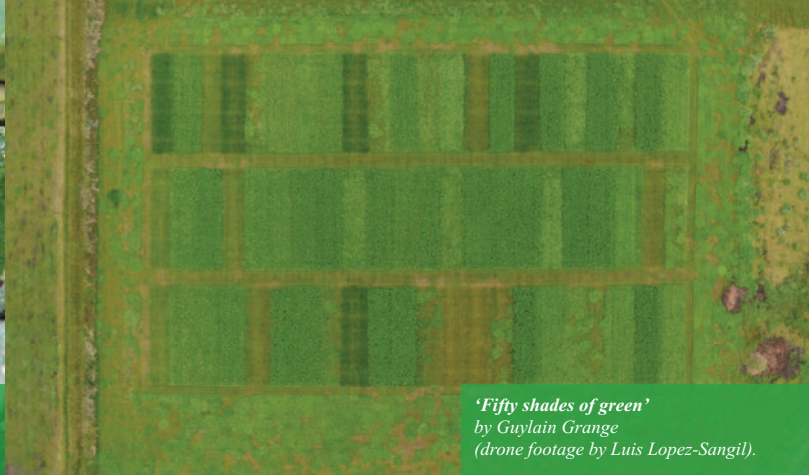
'Fifty shades of green' by Guylain Grange.