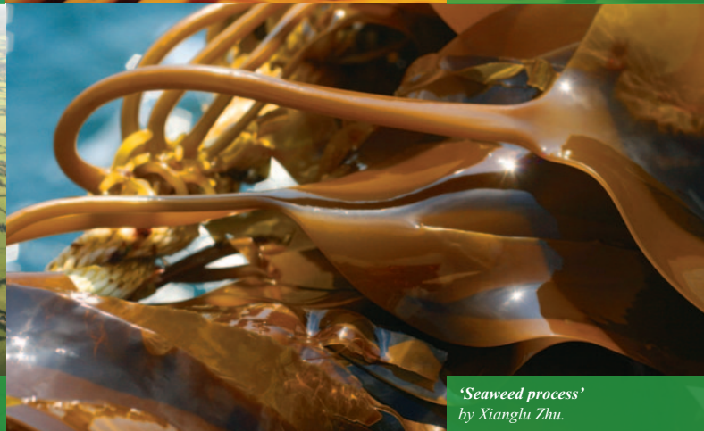
'Seaweed process' by Xianglu Zhu.