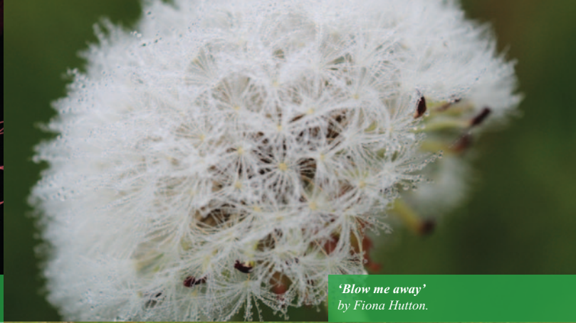
'Blow me away' by Fiona Hutton.