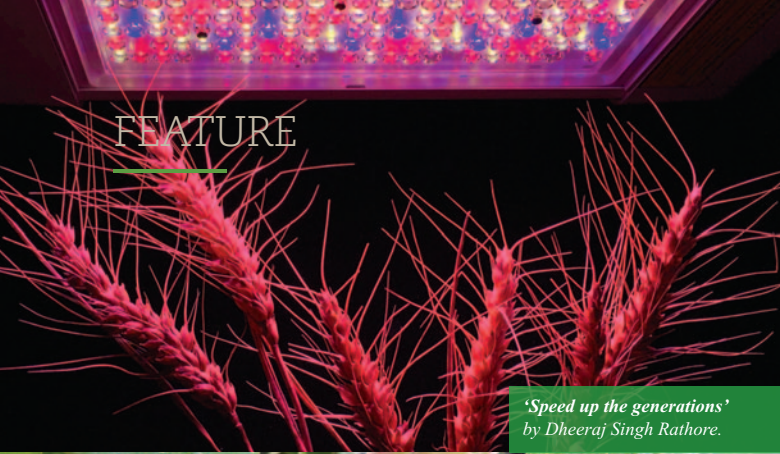
'Speed up the generations' by Dheeraj Singh Rathore.