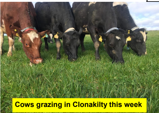
Cows grazing in Clonakilty this week