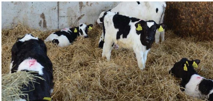
Some of Aidan Maguire's autumn-born calves.

The farm is divided into a total of 45 paddocks with permanent single-strand fencing. Water troughs are carefully located to allow each of these paddocks to be further divided in half using temporary wire.