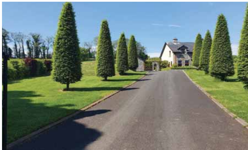
Avenue trees and specimen trees can really add to a property.

particular, the level of investment can be very high. I would recommend splitting the project over two to three years and concentrate on hedging and specimen trees one year and paved areas the following year and so on.