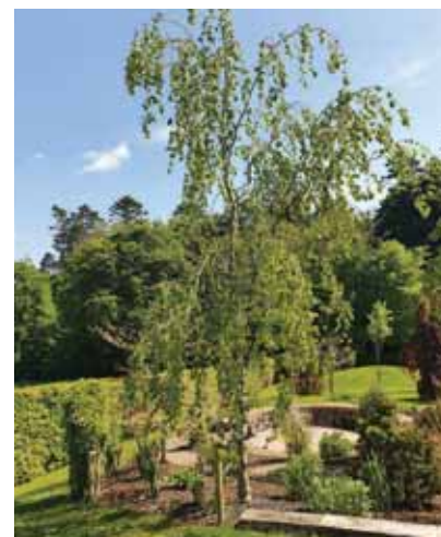
The beech tree Fagus sylvatica Pendula adds interest to the garden.

When it comes to paving and planting, visit a job a landscaper has carried out previously as this will showcase their workmanship. When it comes to spending money on garden projects spend it once and spend it wisely.