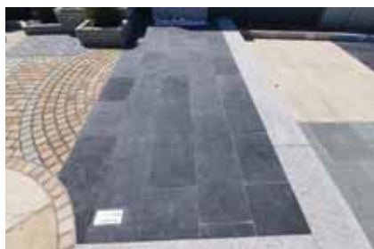
Using a mix of granite as a border and limestone provides excellent contrast.