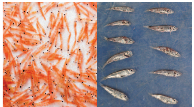
FIGURE 1: Euphausia superba (krill) and Maurolicus muelleri harvested from the twilight zone.

Food production from sustainable fisheries is a responsible way to increase food supply without arable land, irrigation or fertilisers. Many forms of aquatic animals have smaller greenhouse gas (GHG)