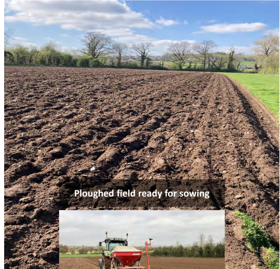
Ploughed field ready for sowing