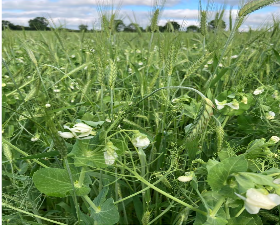
Arable silage pea triticale mix