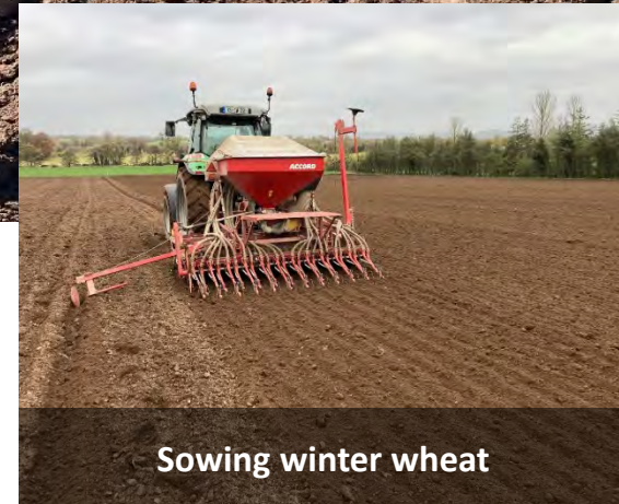
Sowing winter wheat