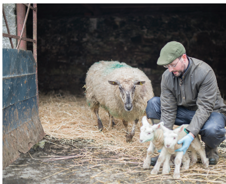
A lambing review can help you improve performance.

Measure the lambing/health performance of your flock by carrying out a lambing review when lambing is finished and the information is fresh in your mind. The review will not only capture lamb mortality, but will also look at incidences of health issues such as prolapse, joint ill, abortion, etc. By establishing how your flock is performing, you can then put a plan in place to improve performance next year. Contact your local advisor about doing a lambing review.