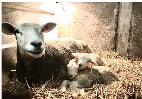
Lamb prices have been very high lately.

At the time of writing (mid March) we are experiencing historically high lamb prices. For early-lambing flocks, it is important to draft lambs regularly as they come fit. Avoid selling lambs that are over the cut-off weight, as you are giving away free meat that has been costly to produce. Intensively fed lambs will kill out between 48% and 50%. Monitor your kill outs and adjust drafting weights accordingly as the season progresses.