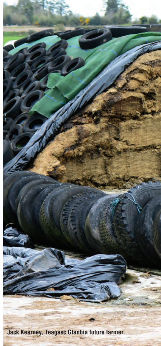
Jack Kearney, Teagasc Glanbia future farmer.

On this point, it is vital to consider the yield of forage DM across the year as a whole, not just from a single cut. Figure 2 shows the effect of different first cut dates on total grass silage DM and forage energy (UFL) yield per hectare, in a two-cut system with a