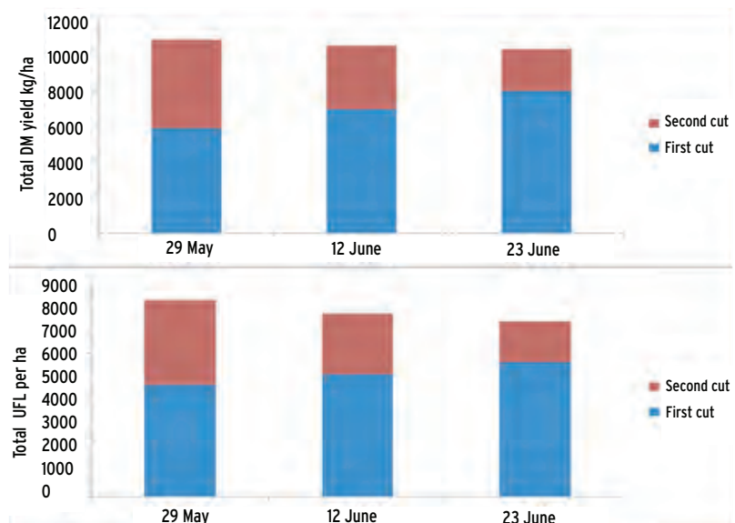
Figure 2: Effect of first cut date on total silage DM and UFL yield in a two-cut system

Having adequate fodder storage space is critical. Investment in this aspect of farm facilities has been relatively low in recent years, despite significant increases in dairy herd size in particular. Teagasc recommends that forage storage costs be factored into any farm development plan where annual feed demand is increased.