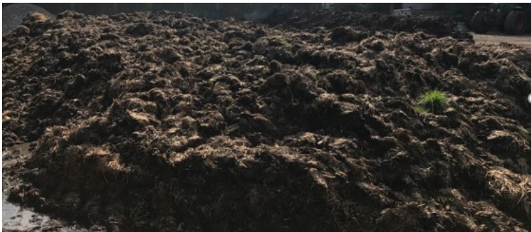
Farmyard manure on the farm

The farmyard manure is stored in a clamp. It is turned 4 to 5 times over a period of four months.