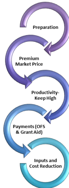
Figure 2: – Components of Profitable Organic Production

A number of key components that lead to profitable organic production are included below in Figure 2.