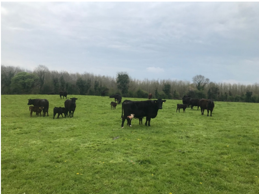
Suckler herd on farm

The cattle are grazed in one group on a rotational basis around the farm. Fields are divided into 3-4 acre paddocks. Cattle are housed for the winter around the 1 st of December. Cattle are back out grazing from mid-March according to when cows calve.