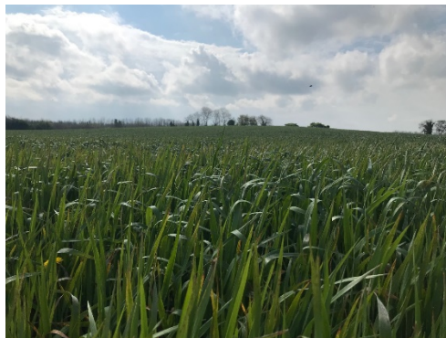
Winter Oats on the farm