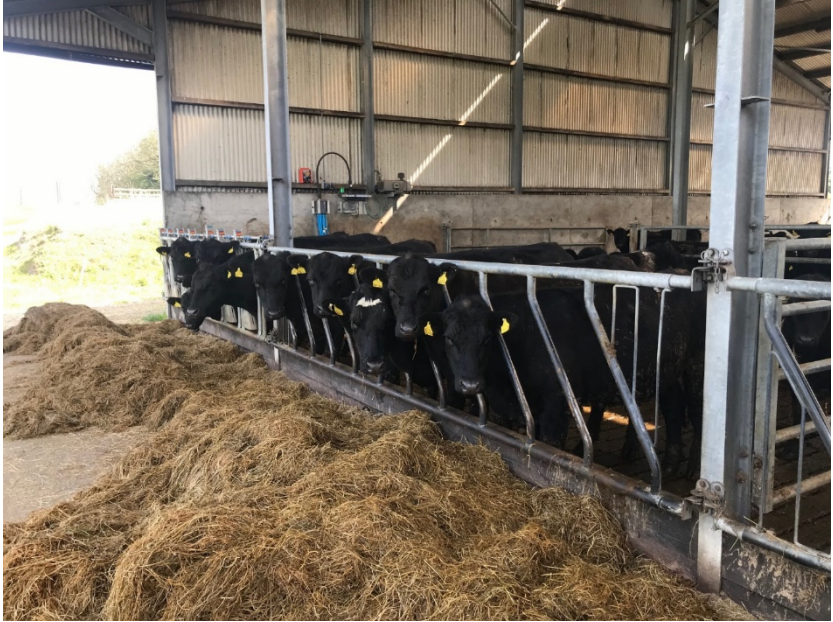
Cattle Shed on the farm