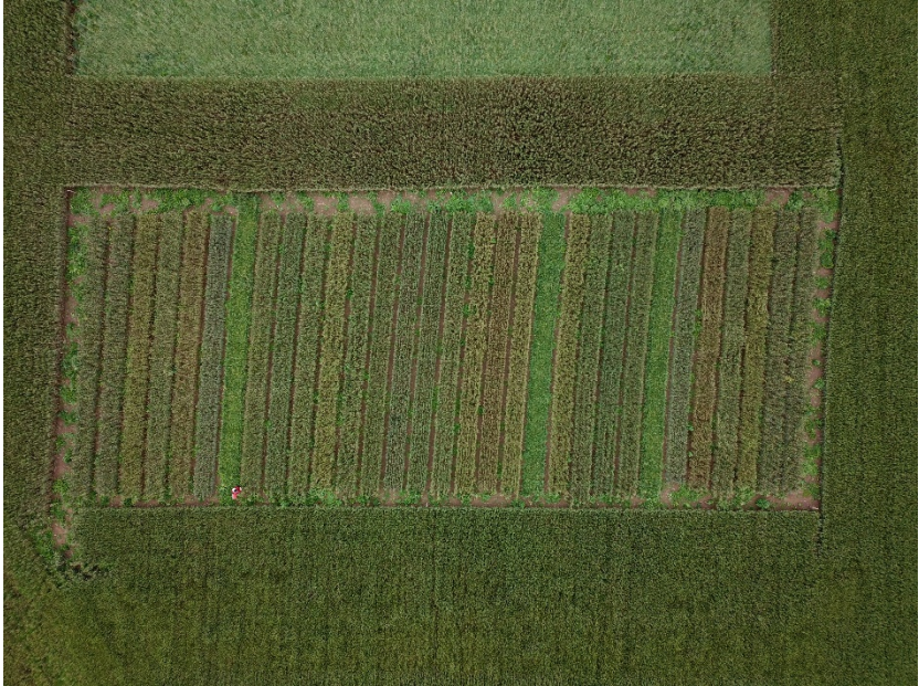
Drone image of Trial Plots on the Keane's Farm

research is required to fully explore their capacity and adaptability to agricultural, environmental and market variabilities.