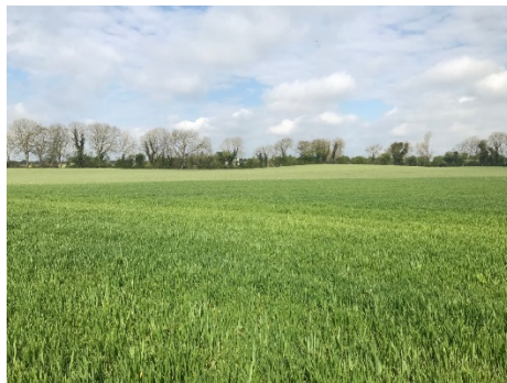
Oats on the farm