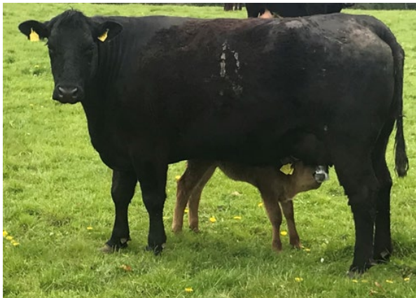
Suckler cow and calf