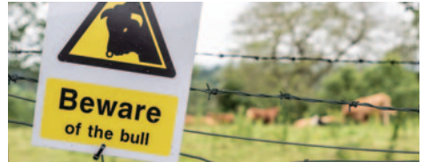
Watch out for aggression.

calves accounted for 32% of livestock-related fatalities from 2012 to 2021. Cows can be aggressive when they are protecting their young or at stressful times such as calving. When possible, keep a barrier between you and the animal. Bulls accounted for 18% of fatalities from livestock. Breeding bulls should have a nose ring on them at 10 months of age. This should be fitted by a vet. Bulls at pasture should also have a chain fitted to the nose ring, so if an attack occurs there is a means of controlling the animal. Aggressive animals should be culled from the herd to reduce the chances of an incident occurring. When making breeding decisions or buying in stock, docility, which is a heritable trait, should be considered.